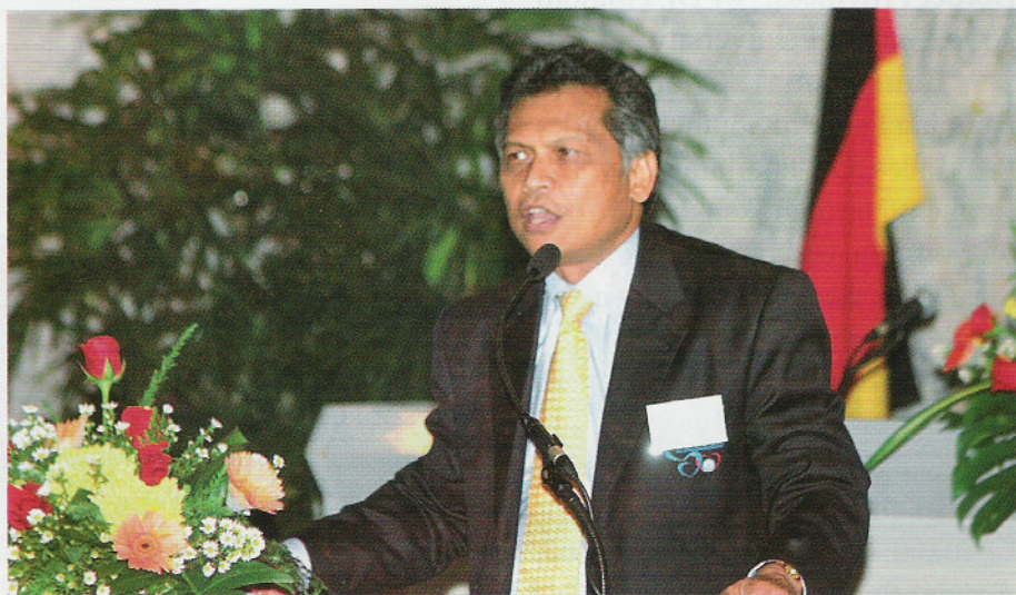
Dr. Surin Pitsuwan delivers his keynote address on achieving peace in Southern Thailand during the seminar held at Hall of Fame on September 1, 2006.