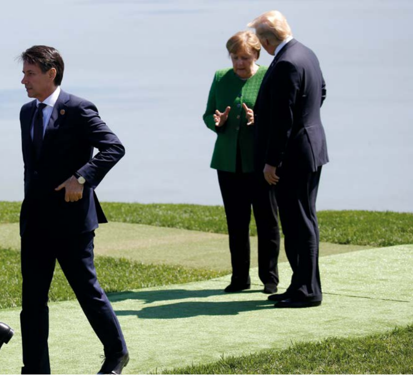
Mood of crisis? The multilateral order is under pressure.

This rivalry also plays out in multilateral fora and in some cases brings international cooperation to a standstill. The most recent example of this was the impasse in the UN Security Council on the COVID-19 pandemic, which led to a binding resolution being deadlocked for several months. The US withdrawal from the allegedly China-centric WHO is another example of how multilateral institutions are being weakened by rivalries between the great powers.