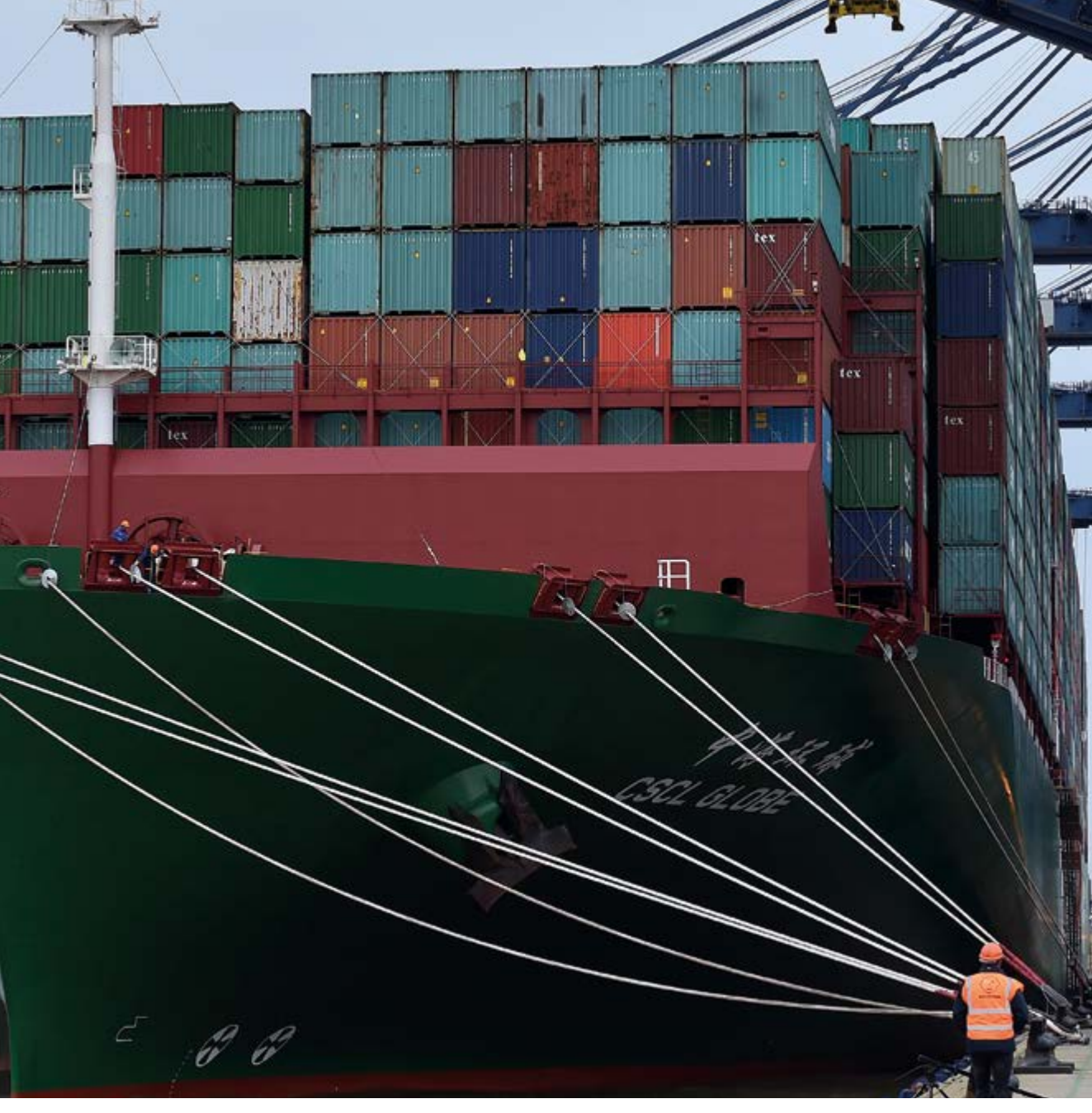
Globalisation under criticism: The current health crisis could also serve to drive inversion and the partial relocalisation of economic production.

and populist tendencies are also embodied by Brazil's President Bolsonaro (e.g. Brazil's withdrawal from the UN migration pact) or – with a dual approach – Turkey's President Erdoğan, who is pursuing a strategy of cherry-picking, particularly with regard to the EU. He wants financial incentives for sharing the burden of taking in Syrian refugees and upgrading