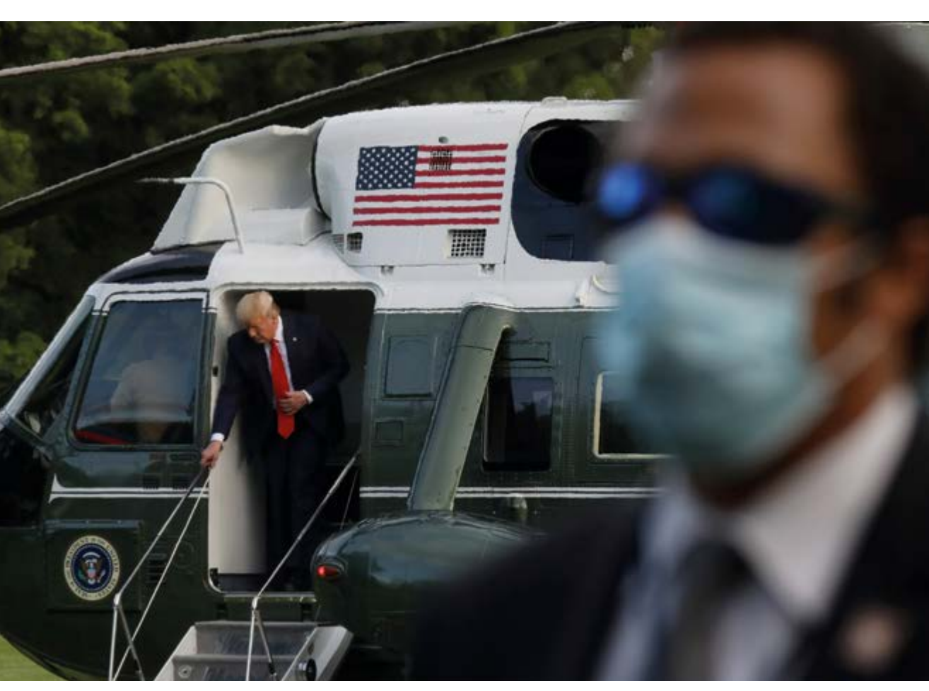
Inconceivable a few years ago, not even surprising today: The US is not at the forefront of coordination efforts to combat the coronavirus crisis.