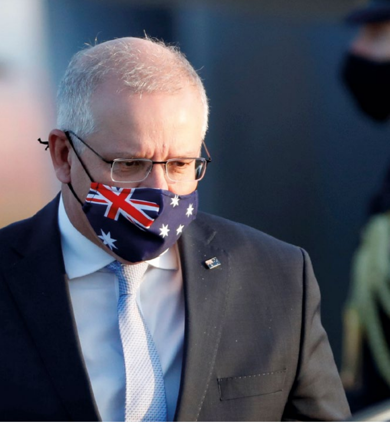
"We have a vision of an open, inclusive and prosperous Indo-Pacific": Australia's Prime Minister Scott Morrison sees his country as a creative regional power that plays a decisive role in shaping the development of a regional security architecture.

Scott Morrison's remarks at the 2019 Shangri-La Dialogue also made clear Australia's continued commitment to the close integration of foreign and economic policy in the region, noting: "We