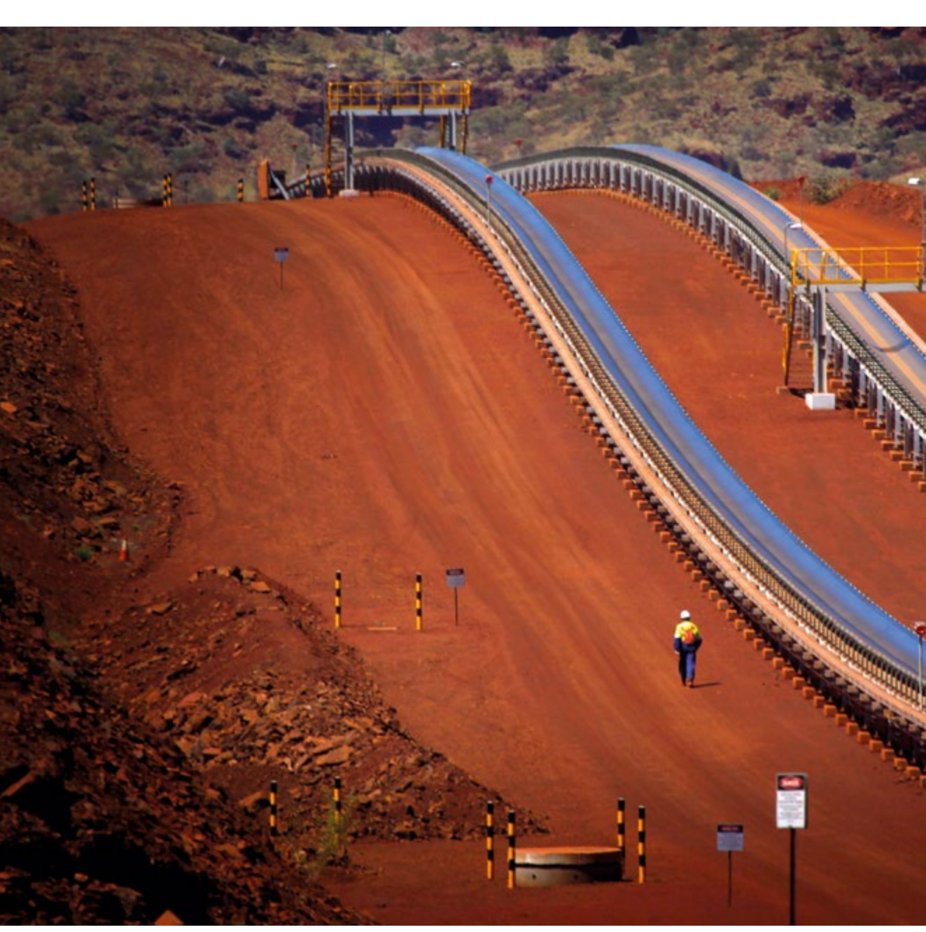
Economic powerhouse: Australia is set to become the world's 12th largest economy and, as a commodity-based exporting nation, enjoys a trade surplus.

As a result, the Australian Government is increasingly seeking to forge partnerships in the region and to exert greater influence in regional and international organisations, as well as in forums such as ASEAN, the ASEAN Regional Forum, ADMM Plus, PIF, the Asia-Pacific Economic