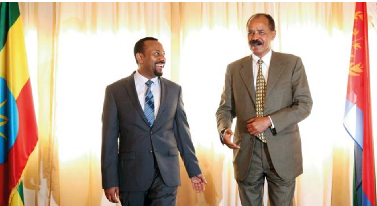
Maintaining the reform agenda: With his moves towards democratisation and peace with neighbouring Eritrea, Ethiopian Prime Minister Abiy Ahmed (to the left) has sparked hope among EU leaders.

For a normative actor like the EU that engages in budget support with numerous (semi-)authoritarian states around the world, political conditionality remains an important policy tool to retain leverage. It can be used to underline values and priorities when engaging with development partners as well as to prove to domestic audiences that development funding serves its purpose. It is necessary and legitimate for politicians and citizens to raise questions about the