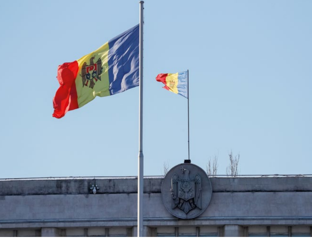
What are judges allowed to do? In Moldova, no explicit rules of conduct have been established with regard to expressions of opinion on social media.

social media. Judges are also prohibited from supporting, promoting, or evaluating in any manner campaigns, pages, or posts by activists or groups if this could damage the reputation of the judiciary. In this law, with all its concrete guidelines and requirements, there are also broad and vague formulations that are unlikely to ensure that statements are evaluated in a non-arbitrary manner.