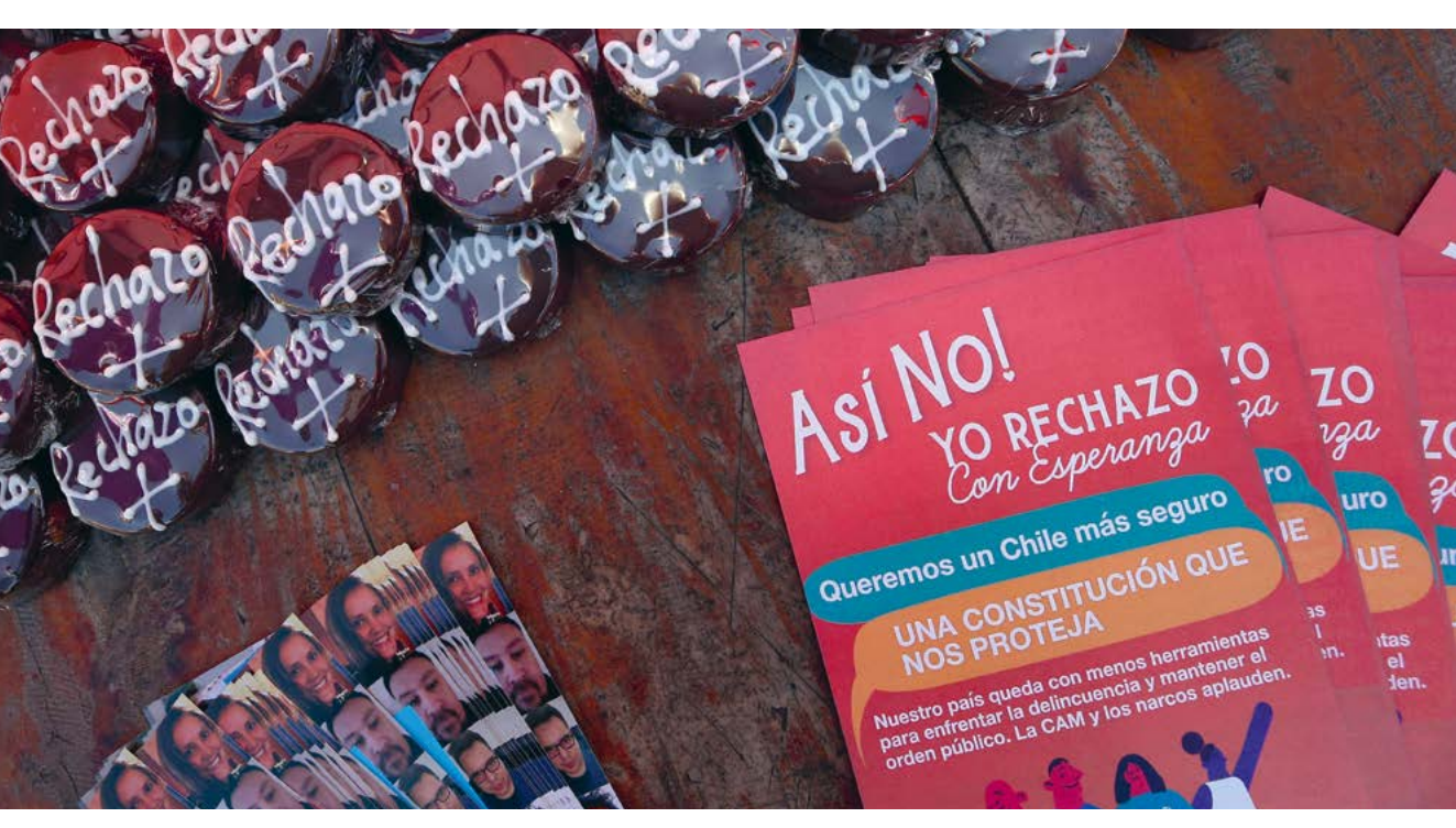
"Not that way!": Although a majority in Chile still wants constitutional reform in general, the draft presented in mid-2022 by the left-leaning "Constituyente" failed miserably.

Chile will continue to struggle in the years ahead to create a new constitution. This issue will continue to dominate political debates (and likely elections as well). The only eventuality that can be ruled out at the moment is that there will be no more constitutional reform after the