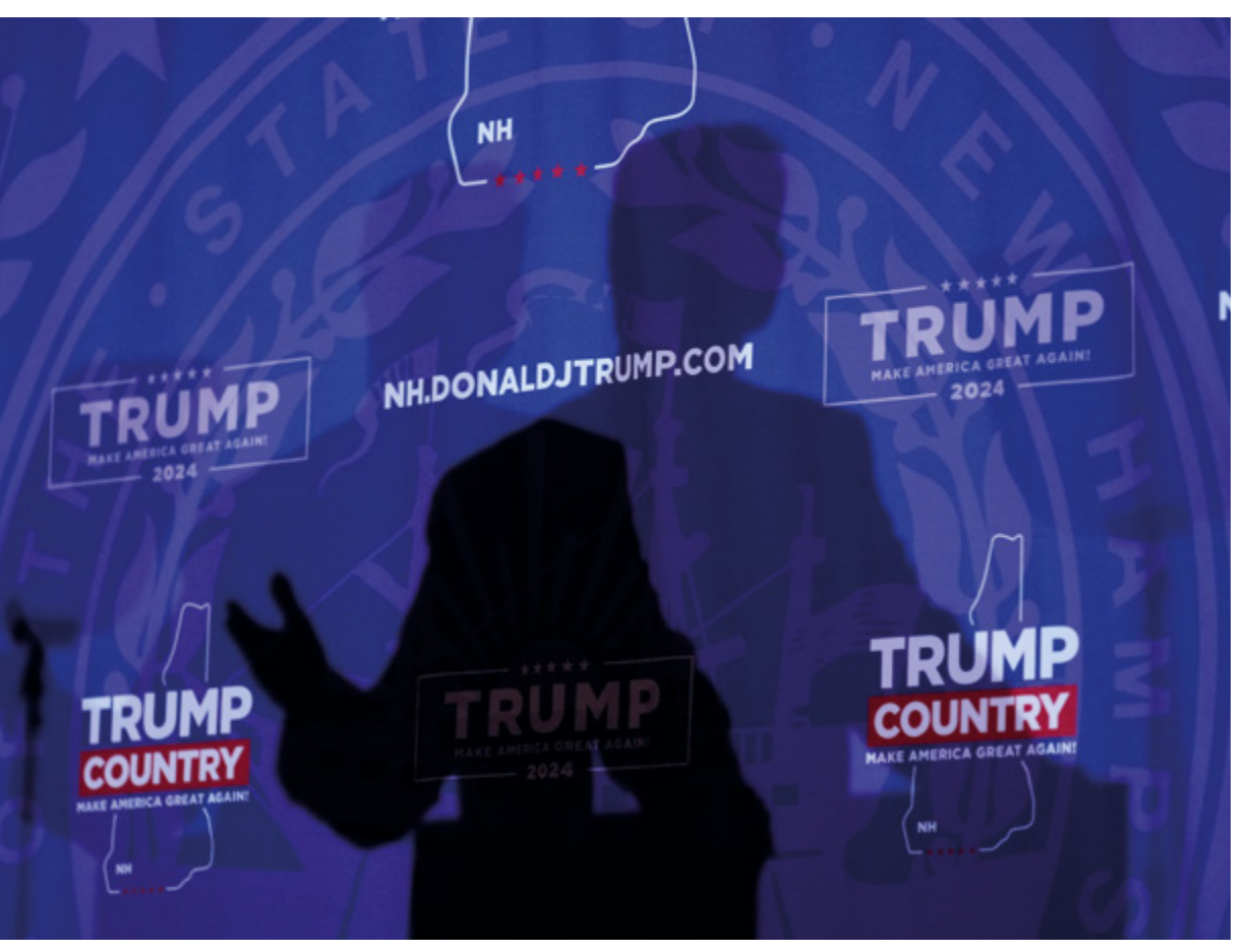
Unclear picture: Whether Donald Trump will once again be elected US President in November is just as open as the question of his specific policy towards NATO. What is clear, however, is what Germany and Europe can do: invest more in their own defence.

scarcely increase security in the Indo-Pacific. The light infantry and armoured units deployed in Europe would be of little use in a conflict with China. The US Navy and Air Force would have to shoulder the main burden in an assumed conflict scenario with China.