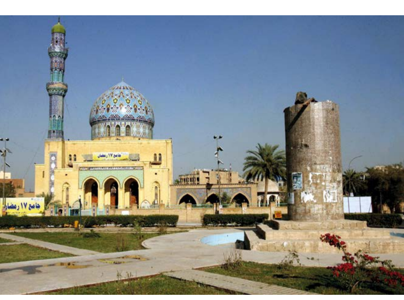
Gaping void: After the fall of Saddam Hussein, the US-led forces largely dissolved his security apparatus – initially creating a security vacuum. The picture shows Firdaus Square in the centre of Baghdad with the pedestal that bore a statue of the Iraqi dictator until 2003.

An expression of Iraq's limited statehood in the past few years has been its weak security institutions. While Iraq now has control over its entire territory for the first time since 2014 – a noticeable advancement – a long-term strengthening of the army and police force remains one of Iraq's major challenges given the security situation. What is more, there are the Popular Mobilization Forces, an umbrella of militias that is nominally under Baghdad's