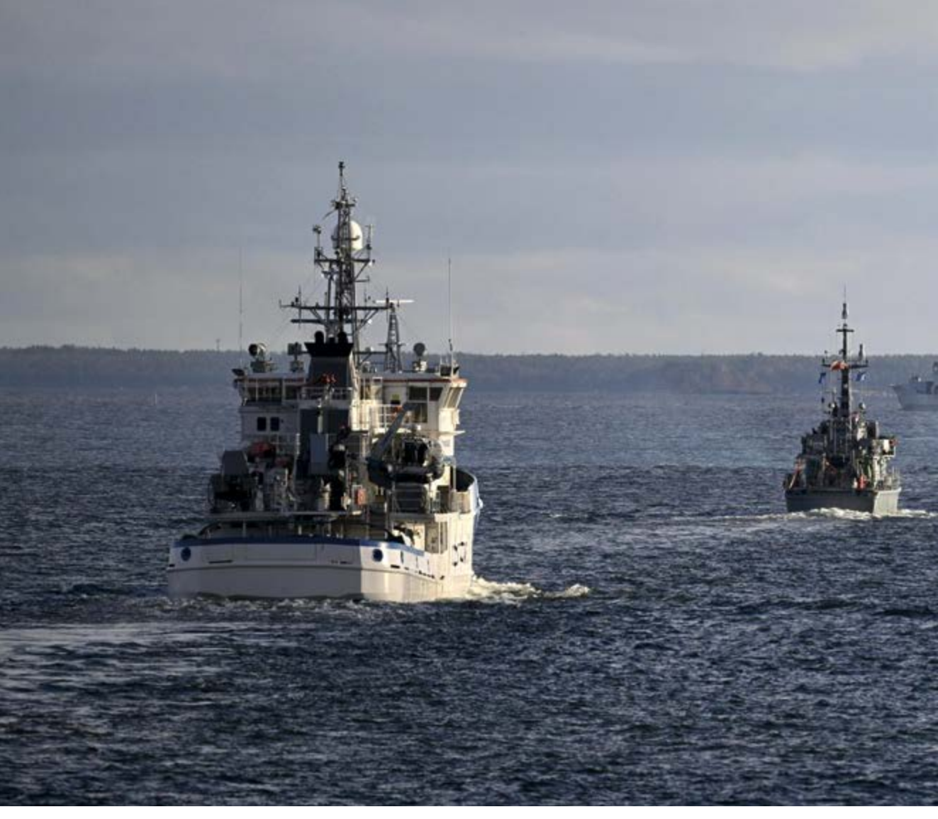
International exercise led by the Finnish Navy: Finland's accession to NATO strengthens the Alliance. The same applies to Sweden.

can and must intensify, but the road is clearly marked and it is a good one in my view. Europeans in NATO are also doing a great deal – I have already mentioned the European Sky Shield Initiative. The next step will depend on combining the productivity-promoting capabilities of NATO and the EU in an optimal way, especially when it comes to supporting the armaments industry, and maximising cooperation and coordination. That's where I see the most potential for optimisation. We have European armaments industries that are structured very differently. In some countries, they have a strong market economy focus, while in others the state owns large shares in armament companies. But they all need planning certainty and support. The ultimate concern is identifying gaps and investing accordingly. The path is clearly mapped out.