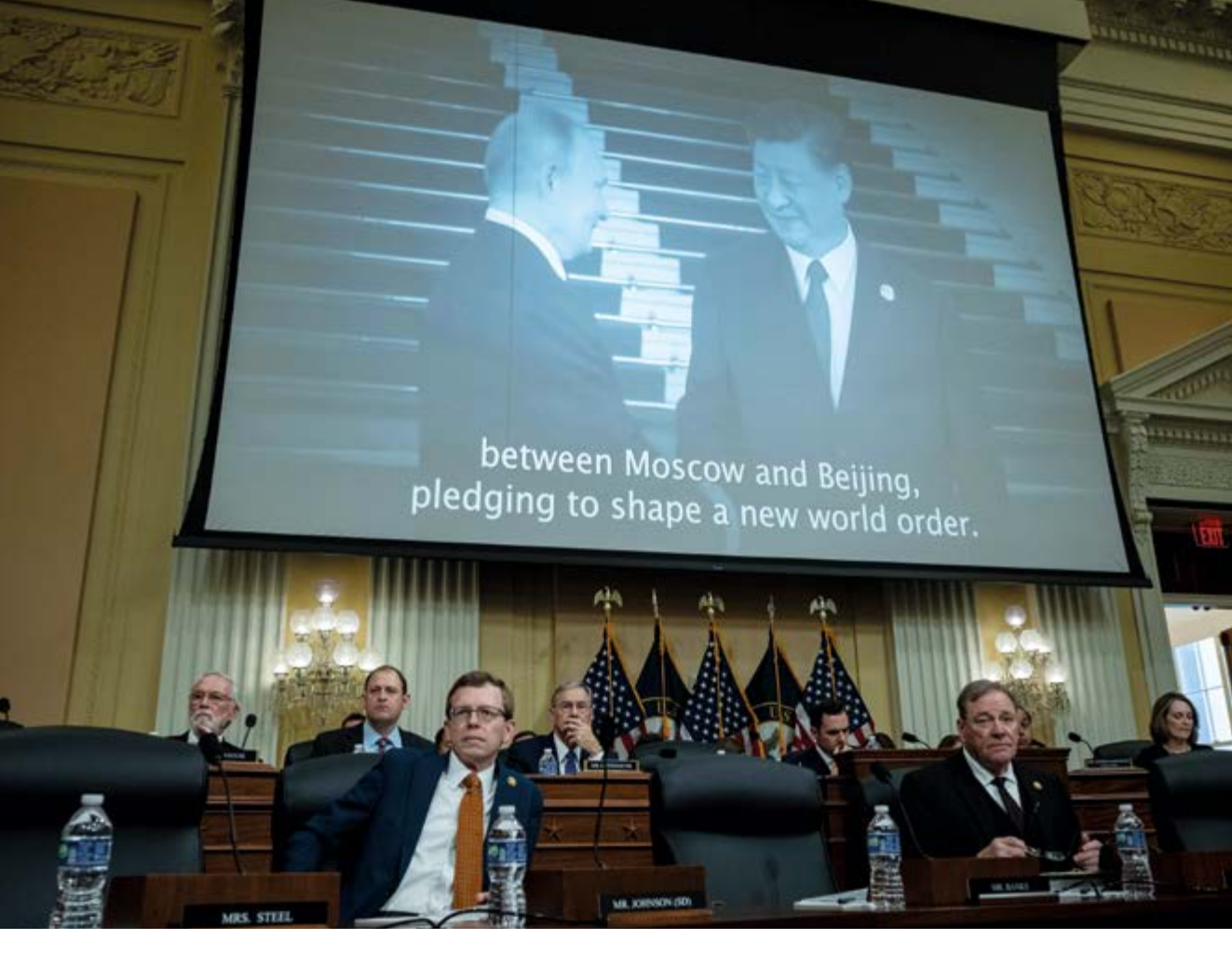
Two parts of the same problem: In the US, traditional hawks and classical liberals see the challenges posed by Russia and China as interlinked, for which a comprehensive plan is required in order to counter both.

reinforced the idea of an anti-American revisionist bloc that cannot be separated into its constituent parts.