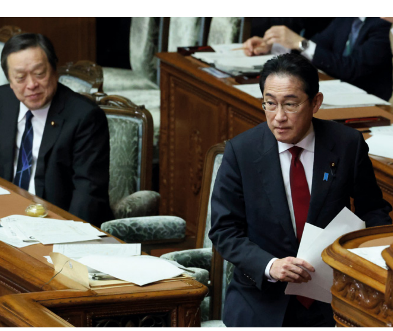
Japanese Prime Minister Kishida facing questions on his country's new National Security Strategy in parliament: While Japan has ramped up its defence efforts in recent years, there are still a number of homegrown obstacles to closer cooperation with NATO.

For an Atlantic-centred alliance such as NATO, expanding the geographic scope of its activities to the Indo-Pacific region is problematic. Japan's priority areas such as the SCS, Taiwan Strait and ECS may be a bridge too far for NATO to extend its resources to, especially since Russia's war on Ukraine is expected to continue over the coming years. The best Japan may be able to expect is NATO pooling its resources to secure a sea line of communication in the Mediterranean and Red Sea areas to ensure that trade routes remain stable and unobstructed by terrorism or Iranian proxies such as the Houthis.