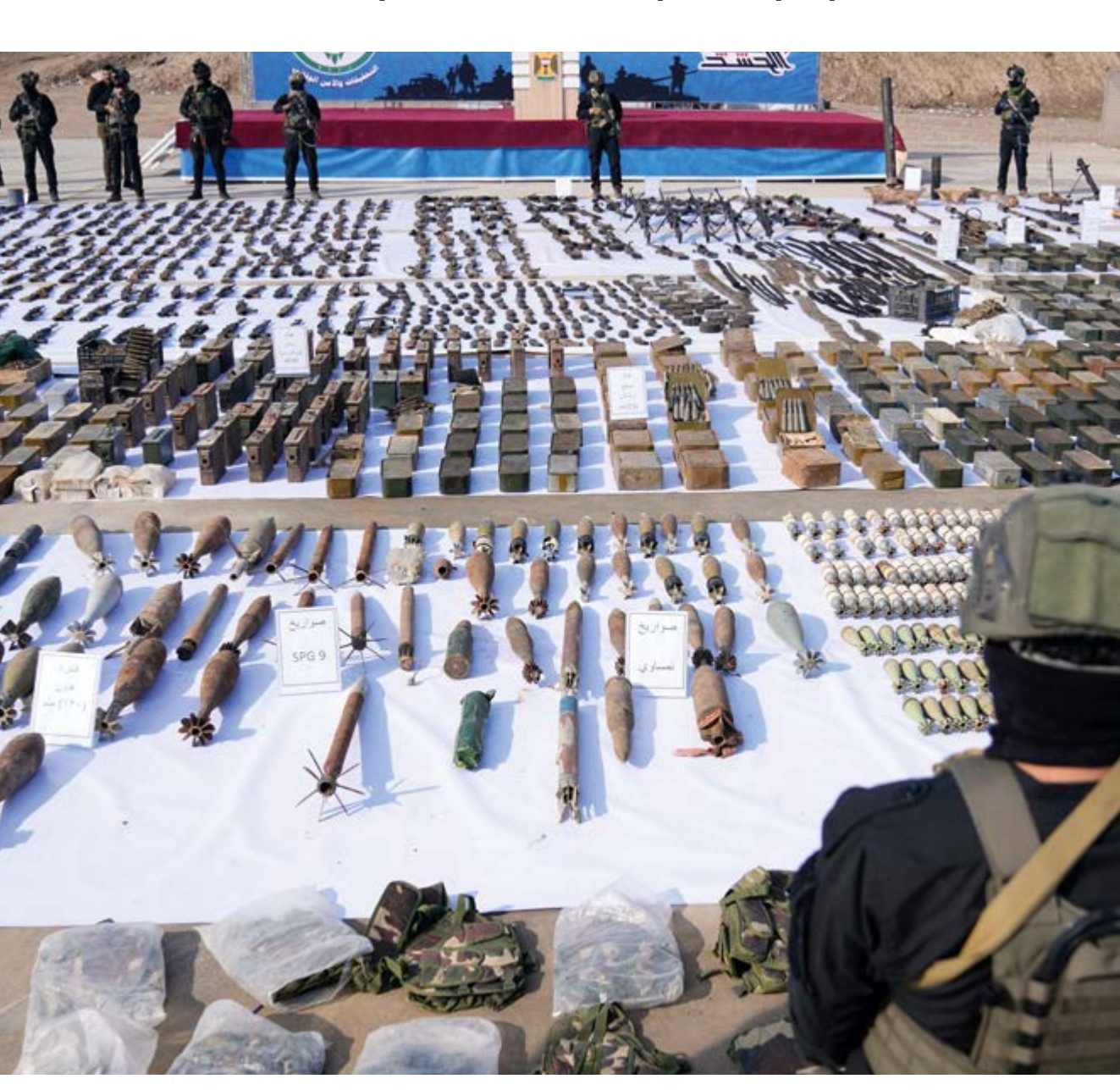
Weapons seized from IS: The Islamist terrorist organisation has been significantly weakened in Iraq in recent years. However, it has by no means disappeared.

tionally call for a withdrawal of American forces to strengthen Tehran's position. Repeated US military strikes against Shiite militias on Iraqi territory have given renewed vigour to these voices. The Iraqi government has so far been cautious. Yet there are also efforts within the government to end combat missions by foreign troops in Iraq. The main reason for this has to do with reputation: Iraq is to prove that it is