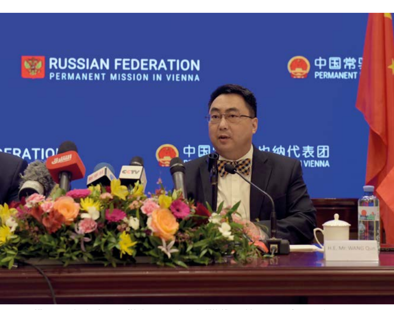
Alliances are what they fear most: China's representative to the UN in Vienna giving a press conference on the AUKUS security partnership alongside his Russian counterpart. Beijing has fiercely criticised anything resembling NATO in the Indo-Pacific.

These practical matters could yield strategic benefits. Some have argued that such patterns of