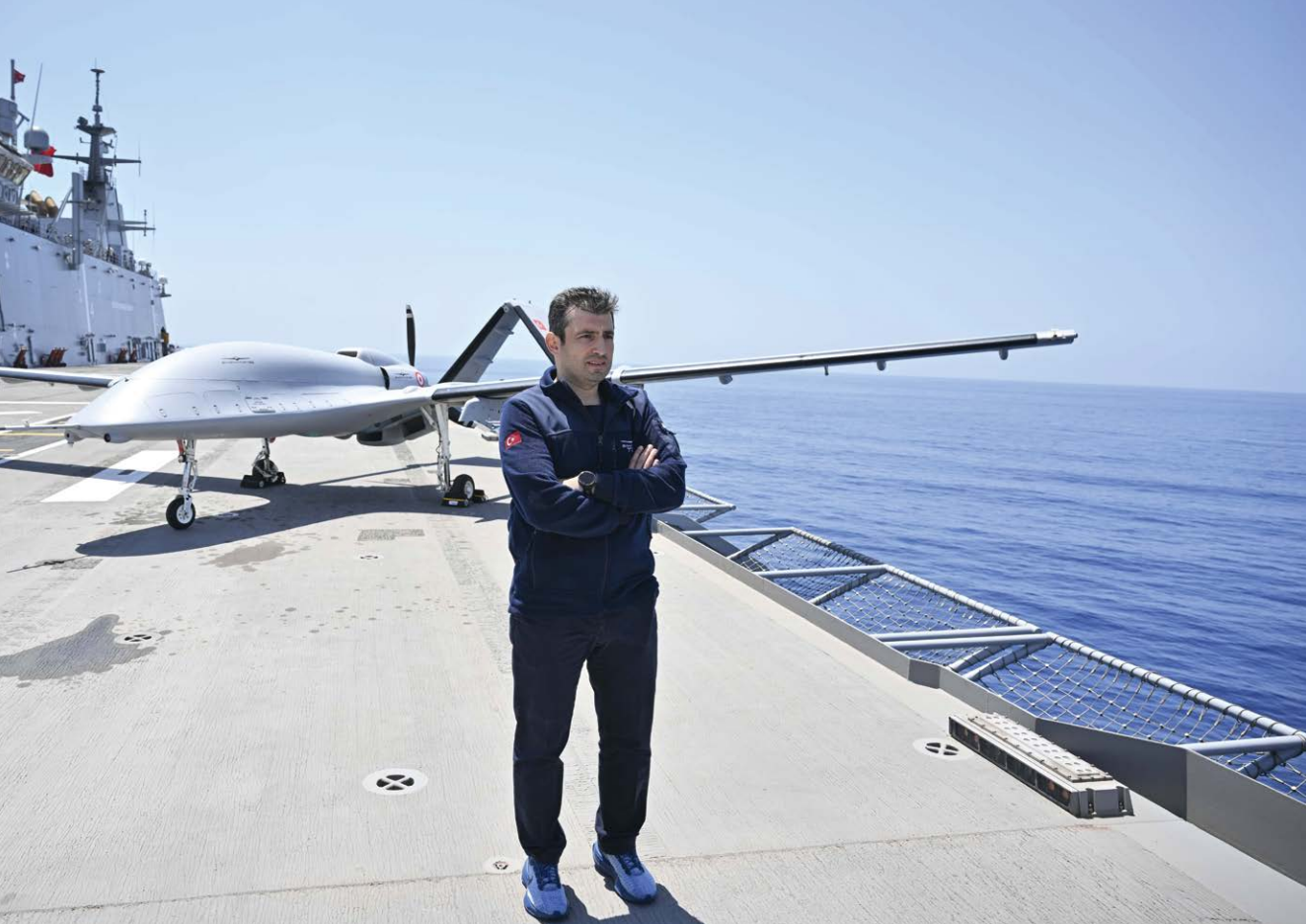
Export hit: Baykar's combat drones are enjoying great popularity in many countries. The company's Chief Technology Officer is President Erdoğan's son-in-law.

Since the Gaza war, the country has expanded its humanitarian aid to the enclave. In Gaza, the Turkish Red Crescent, TİKA, the Ministry of Health, and various Turkish NGOs organize cash relief, field hospitals, medicines, food parcels, drinking water, clothing, hygiene supplies, fuel, and generators. The İHH – a conservative-Islamist NGO supported by the Turkish government – is a key player in Gaza, running an office there that coordinates aid flotillas. It has repeatedly been criticized for alleged cooperation with Islamist groups. 25