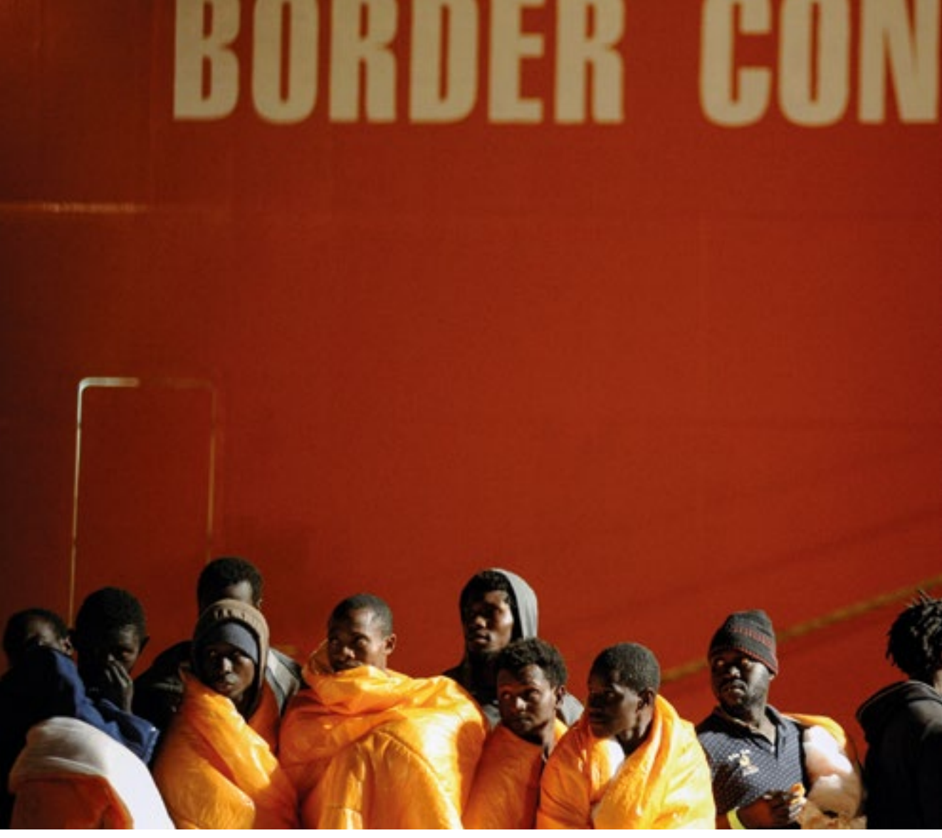
Uncertain future: Whether migration ends up being a destabilising or stabilising factor largely depends on the political situation in the countries of origin and destination.

As a result, efforts in the area of environmental and climate policy must also be understood and advanced in the sense of preventive security policy. A collapse of, or non-compliance with, climate change agreements would have a major impact on international security and stability.