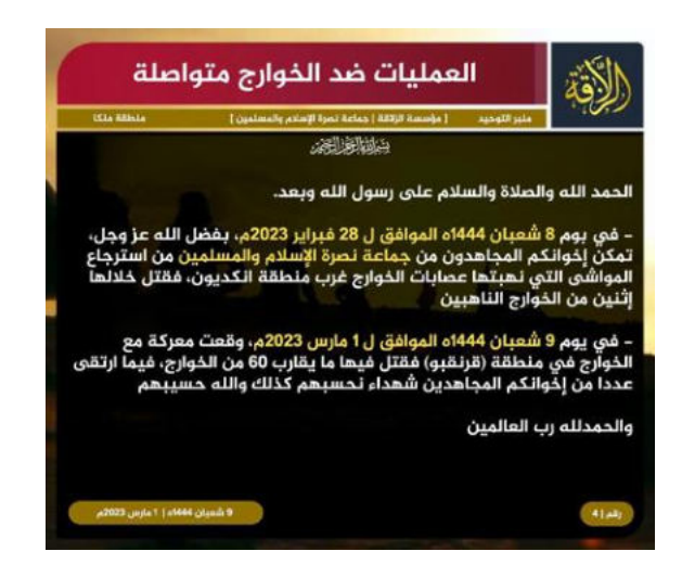
Translation: Operations against several unbelievers