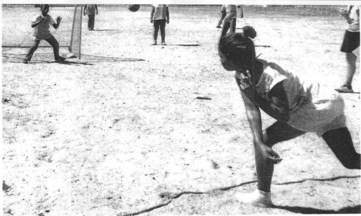
■ Talfalah Primary School pupils in action during a handball training session.