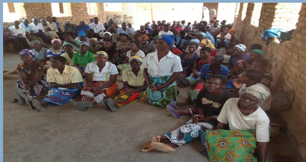
2017 Mzimba community outreach