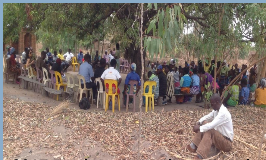
2017 Zomba community outreach