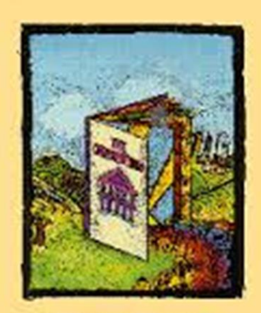
ACT 108 OF 1996