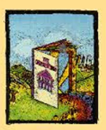
ACT 108 OF 1996