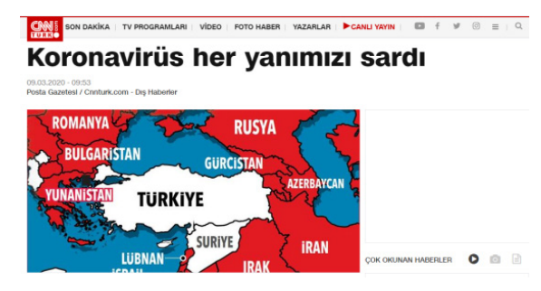
The Turkish headline states: "The Coronavirus has surrounded us from all directions."

However, unlike its neighbors Iran and Greece, which officially reported their first infections in February, Turkey's first cases of the virus were officially reported on March 11. In early April, rumors swirled on social media that Turkey had adopted the downplaying of the number of cases in order to preserve its fragile economy from the effects of the pandemic. Even established media channels like CNN Türk, which typically avoid challenging the official government narrative, began to question - indirectly - Turkey's immunity from the disease by publishing a map showing all of Turkey's neighbors (apart from Syria, whose northern border is under Turkish occupation) as corona infected, while Turkey was portrayed as immune from the coronavirus.<sup>3</sup>