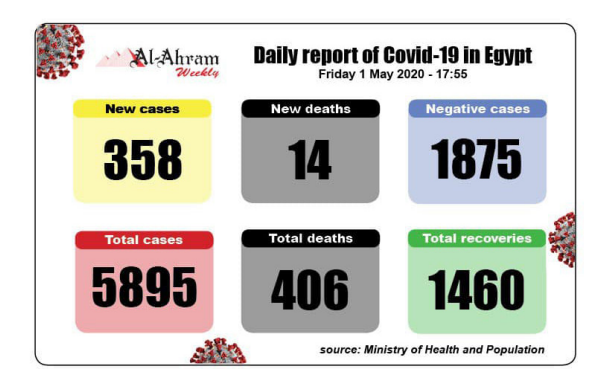
A daily report of Covid-19 in Egypt, May 1, 2020 (Al-Ahram Weekly)<sup>7</sup>

The government has warned Egyptians to be cautious about consuming "fake news" produced by the Muslim Brotherhood or by the foreign media.<sup>5</sup> The Egyptian parliament's decision to expand the emergency laws on April 22 in response to the coronavirus outbreak and to take steps such as suspending schools suggests that the crisis is more serious than the government is willing to admit.<sup>6</sup>