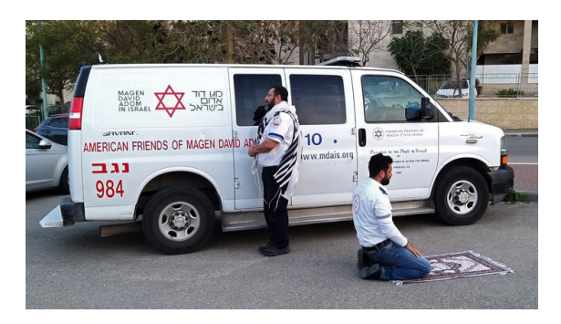
Jewish and Arab paramedics during prayer time.

The effective measures undertaken by the Arab leadership and civil society organization fill a void left by state authorities. Nevertheless, contrary to past patterns where Arab organizations usually operated autonomously, without coordination with state authorities and sometimes contrary to their opinion, in the current coronavirus crisis the activities of Arab organizations and institutions have been coordinated with state authorities.