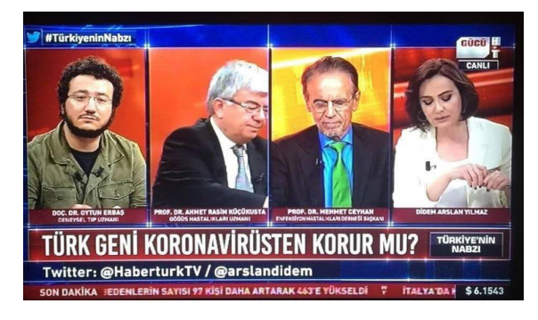
Habertürk News Channel: "Can the Turkish gene provide protection from the virus?" (Screenshot)

On March 17, Koca announced the first confirmed death of a 89 year-old Turkish national who was infected by his employee who returned from China.<sup>5</sup>