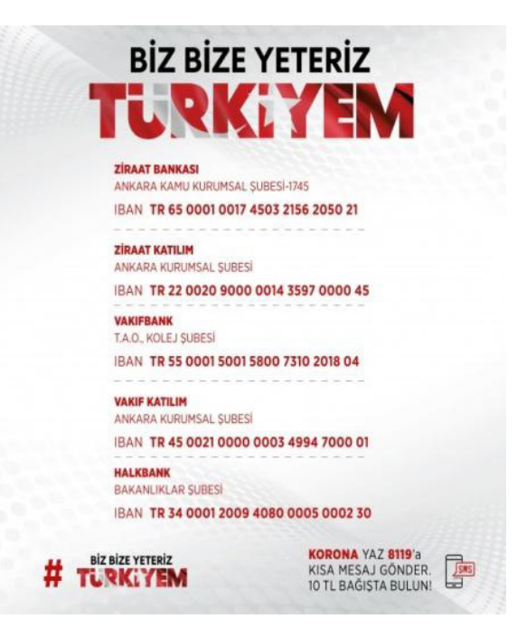
"We are self-sufficient, my Turkey" poster asked for donations. Bank details were also provided.

were implemented in other countries like Germany. However these hopes were dashed when President Erdoğan asked the public to donate money for the needy in the framework of a new public campaign, called "We are self-sufficient, my Turkey" (Biz Bize Yeteriz Türkiyem).<sup>19</sup> Erdoğan donated 7 month's of his presidential salary, and asked Turkish notables to follow him. By April 13, the initiative had raised approximately $240 million.<sup>20</sup>