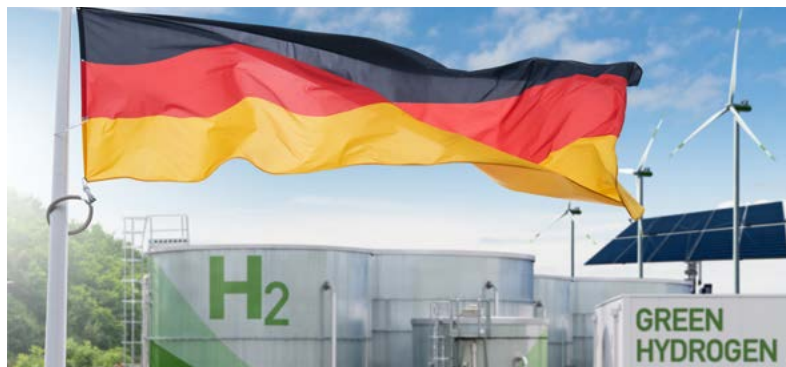
German flag on a background of a green hydrogen factory

As discussed above, IMEC is also expected to strengthen Europe-Israel trade, and Israel’s regional integration and alliances. IMEC-related economic growth and regional cooperation will make an important contribution to enhancing Israel’s national security, another important goal of German foreign policy.