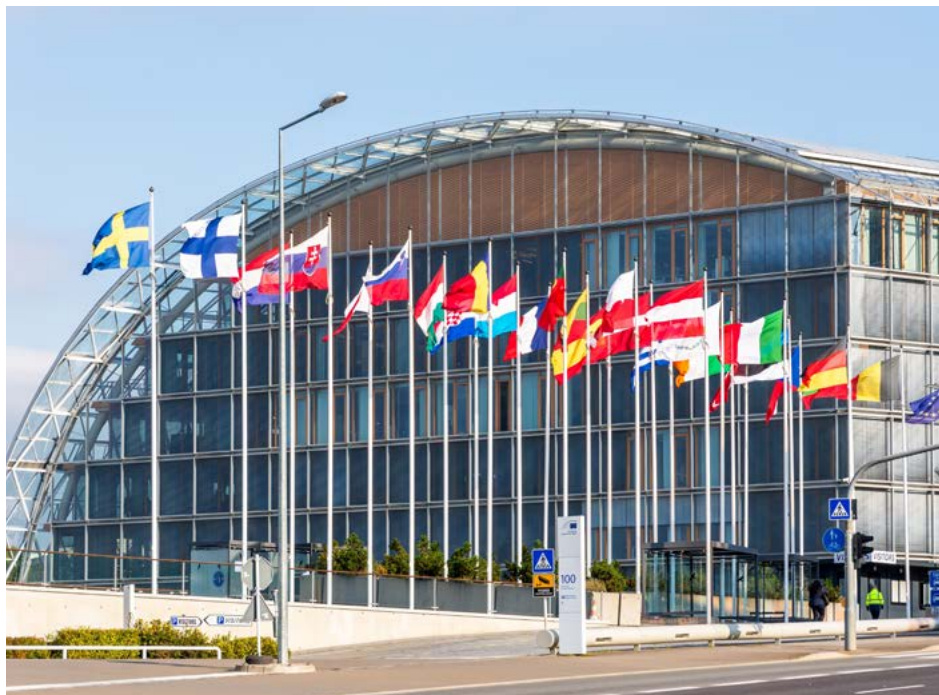
Headquarters of European Investment Bank (EIB) in Luxembourg

It should be noted that at the India-Middle East-Europe Economic Corridor Summit held on the sidelines of the September 2023 G20 summit, Saudi Crown Prince bin Salman announced that KSA would commit $20 billion to PGII. The statement was generally interpreted to be a commitment to contributing such funds towards the advancement of IMEC. 68 However, it is not clear whether these funds will go primarily to IMEC-related projects within KSA, or whether they could go to projects in other countries as well (or to PGII projects unrelated to IMEC.)