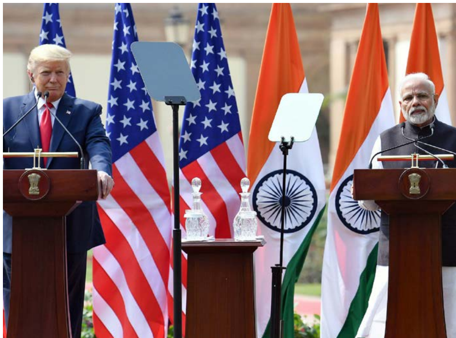
Trump-Modi meeting in New-Delhi

Trump declared at a press briefing with Modi that, “we agreed to work together to help build one of the greatest trade routes in all of history. It will run from India to Israel to Italy and onward to the U.S., connecting our partners, roads, railways and undersea cable.” 12