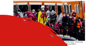
On 18 November, a group of migrants arrived in Italy