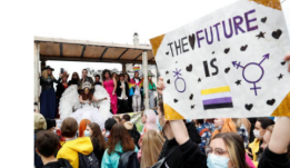
Annual Pride March in Kyiv, with Belgium during 17-19 September 2021.