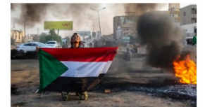
Military dissolved civilian leadership of the transitional government in Sudan.