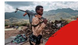
An Ethiopia marks one year of the conflict in the cabinet has declared a state of emergency