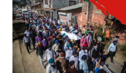
A series of targeted killings in J&K, attacking members of the minority communities.