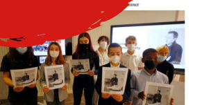
France remembers Samuel Paty, a school teacher beheaded in October 2020 by a radical.