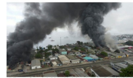
Civilian unrest flares up in the Solomon Islands.

Adhwin Ansumal Dhanushan and Avishka Ashok