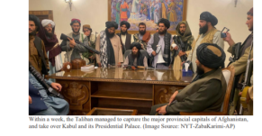
Within a week, the Taliban managed to capture the major provincial capitals of Afghanistan, and take over Kabul and its Presidential Palace.

Afghanistan: After two decades, the Taliban returns with ease, as the political, military and militia leaderships melt without resistance