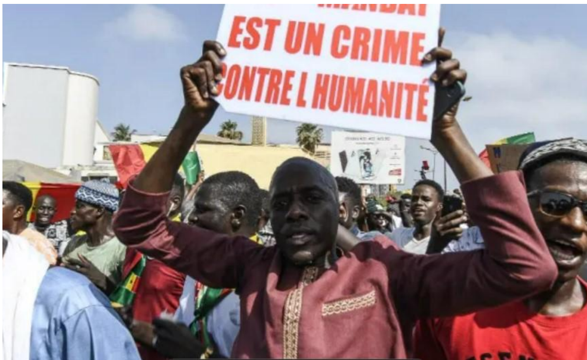
(Senegal opposition supporters protesting against the government in capital Dakar.)