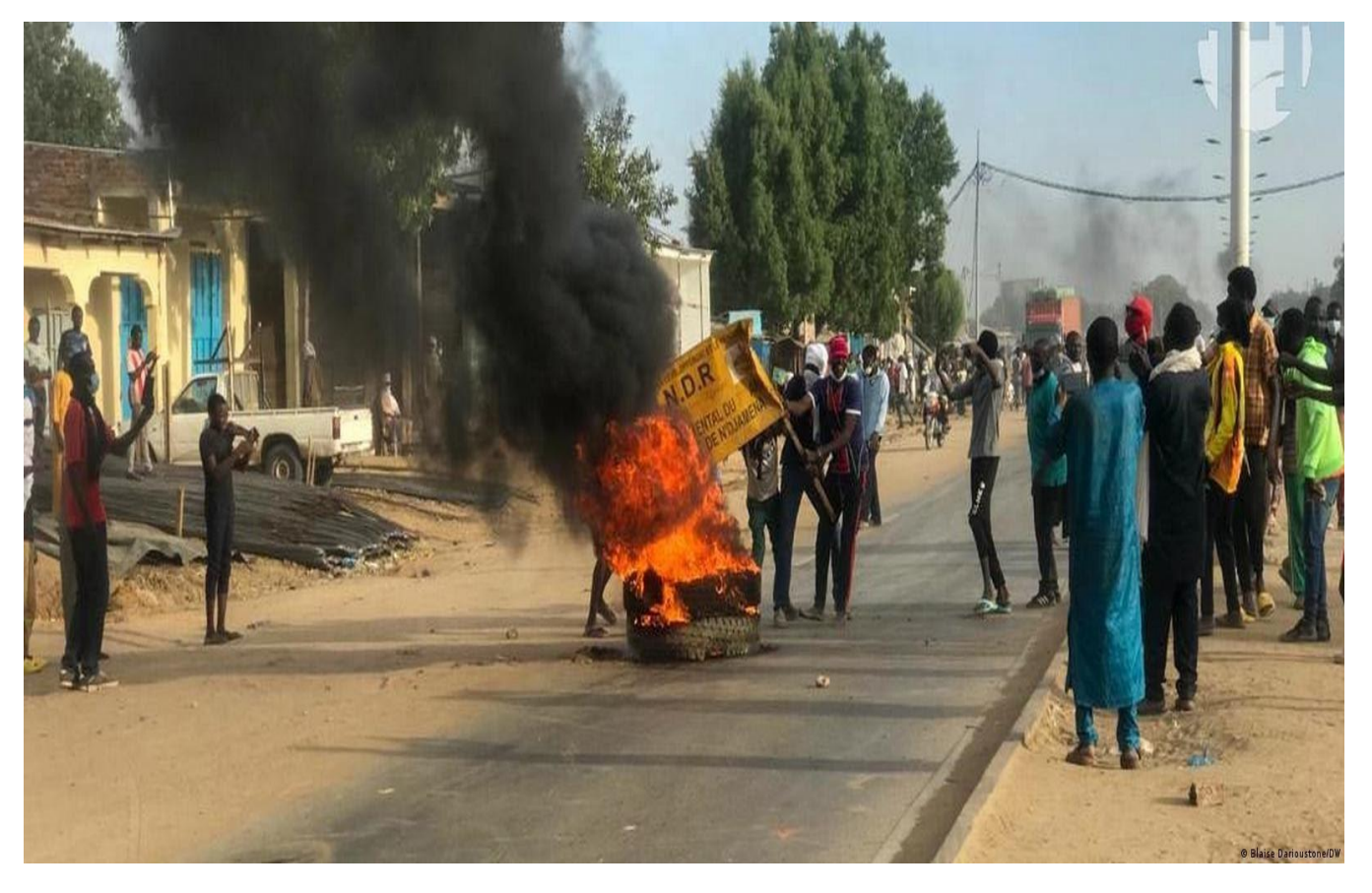
At least 50 people were killed in protests against extension of the transition period until 2024.