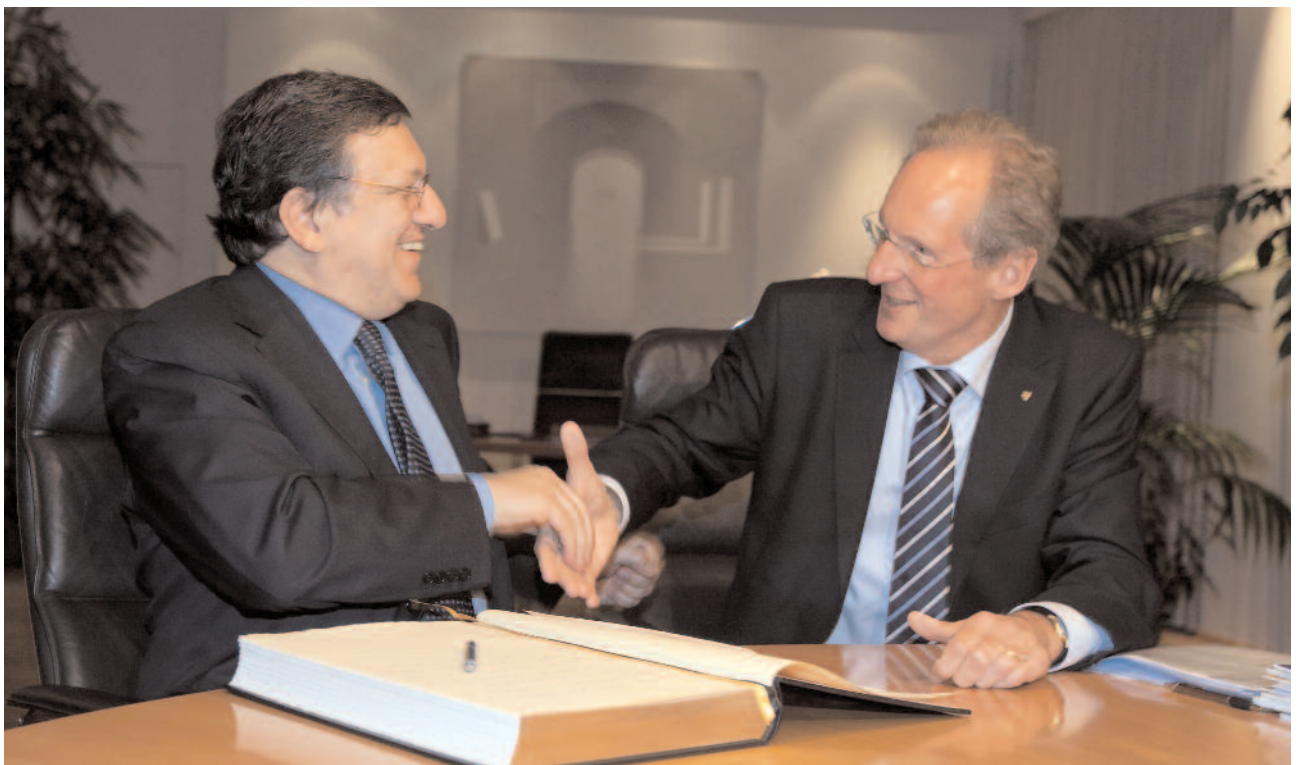
In January 2011 Commission President José Manuel Barroso visited the Mayor of Stuttgart.