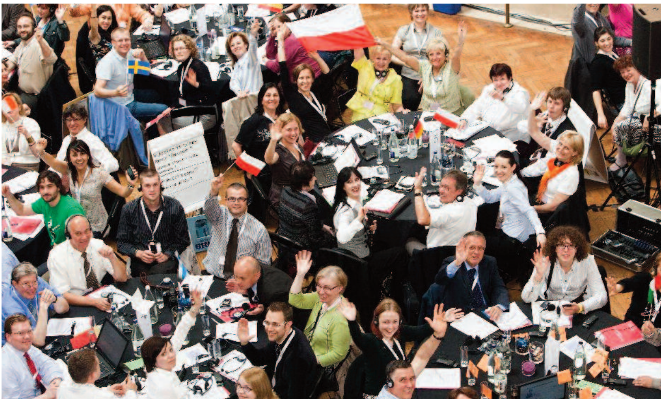
At the 2009 European citizens' summit, citizens from all 27 EU member states discussed the national recommendations.

At the same time, the multitude of participatory processes offers a new opportunity for citizens to identify more strongly with a peaceful, democratic Europe characterised by individual freedom, social responsibility and active solidarity.