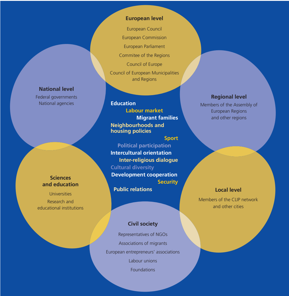
The European Pact for Integration