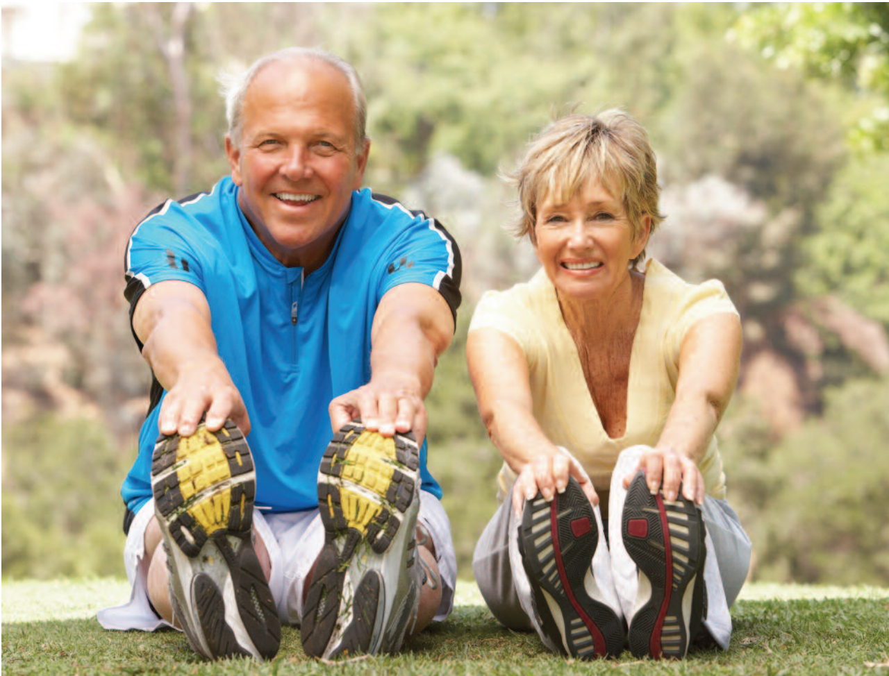
Active and healthy ageing.