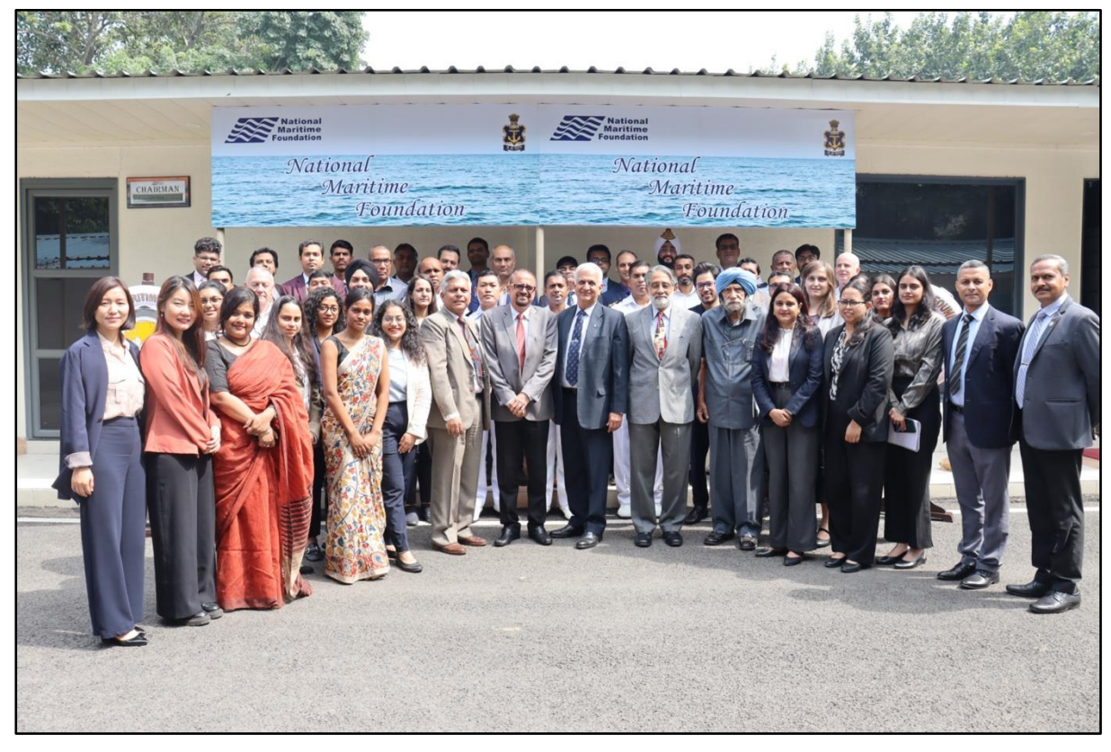
Figure 6: Group photograph taken at the end of the symposium.