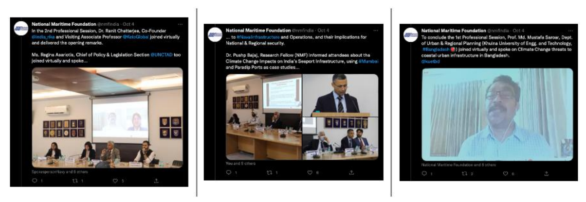
Figure 8: Screenshots #2 of live social media marketing on Twitter during the event. The tweets were made from the official twitter handle of the National Maritime Foundation @nmfindia.