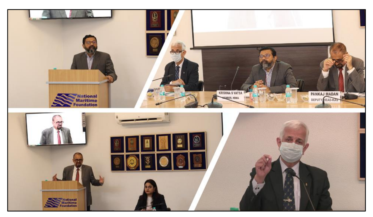
Figure 1: Images from Opening Session.