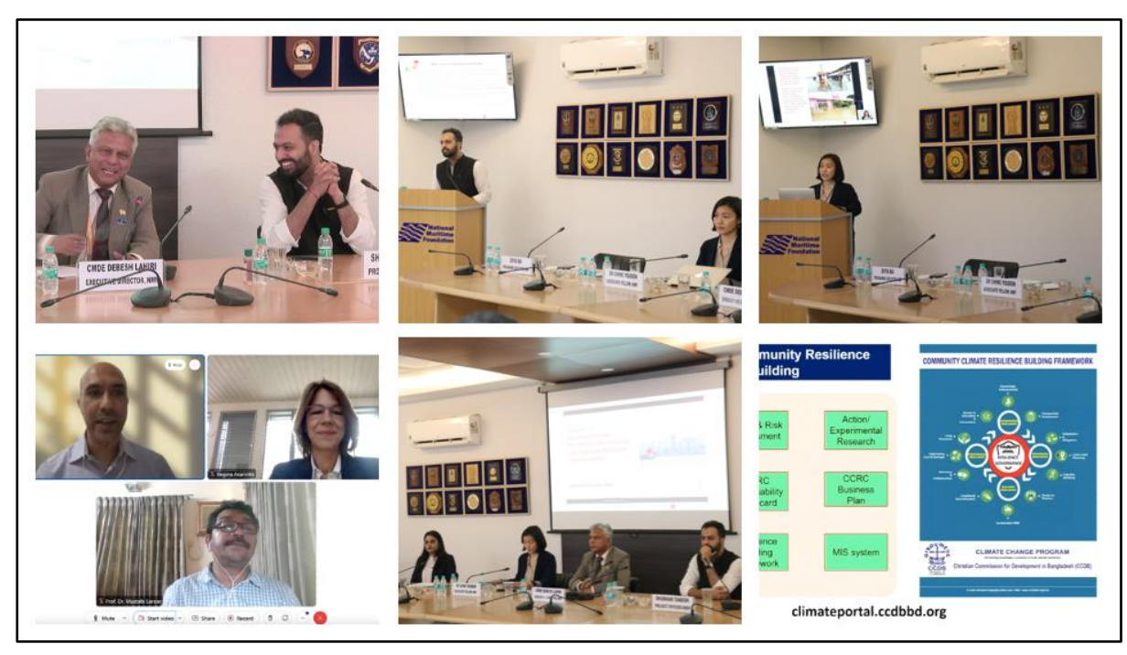
Figure 4: Images from Professional Session II on 'Building Climate Resilience into National and Regional Maritime Infrastructure'' .