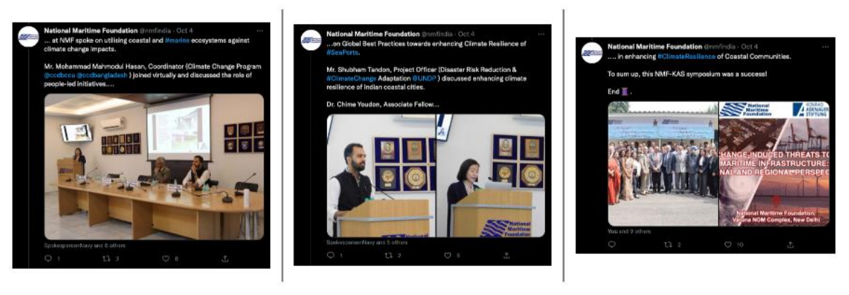
Figure 9: Screenshots #3 of live social media marketing on Twitter during the event. The tweets were made from the official twitter handle of the National Maritime Foundation @nmfindia.

Video Recording: The four-part recording of the event can be found here <a href="https://drive.google.com/drive/folders/1GsgqLZIdSogrWxD3A62gdSBWLBDFNcuC?usp=sharing">https://drive.google.com/drive/folders/1GsgqLZIdSogrWxD3A62gdSBWLBDFNcuC?usp=sharing</a>