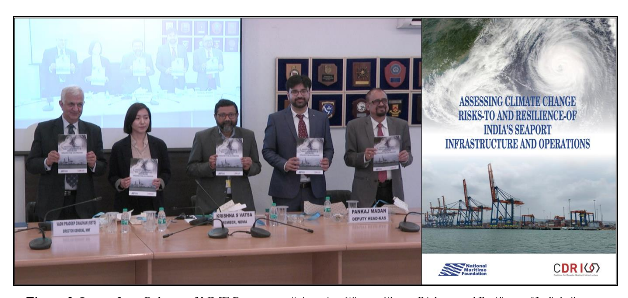
Figure 2: Image from Release of NMF Report on "Assessing Climate Change Risks-to and Resilience-of India's Seaport Infrastructure and Operations".