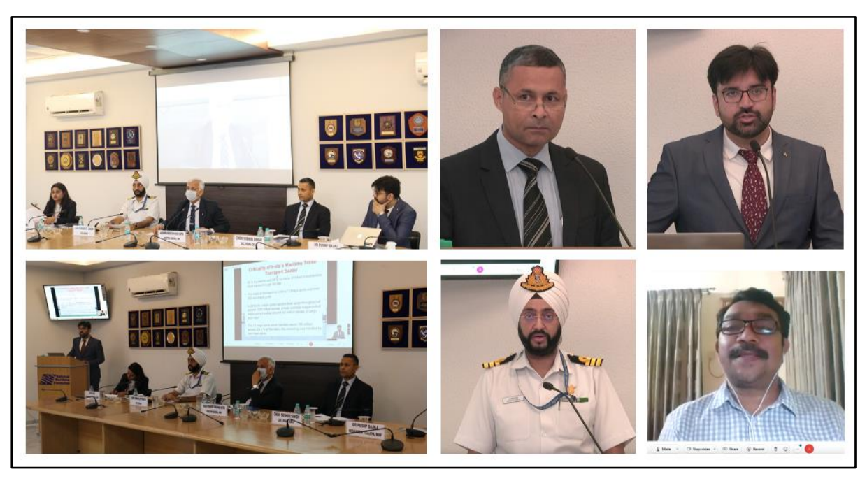
Figure 3: Images from Professional Session I on "Quantifying Current and Projected Climate Change Impacts on Critical Maritime Infrastructure".