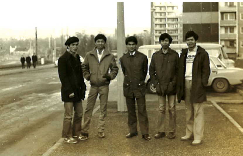
Cambodian students in East Germany.

The FRG recognized Cambodia as a state in November, 1956. 4 The GDR initiated diplomatic relations with Cambodia in 1959. The Central Committee of the Socialist Unity Party of Germany (SED) explained in September, 1959 that 'the current situation in Southeast Asia reveals ... that the USA, West Germany, and other imperialistic powers are increasing their efforts to exploit the financial and economic difficulties