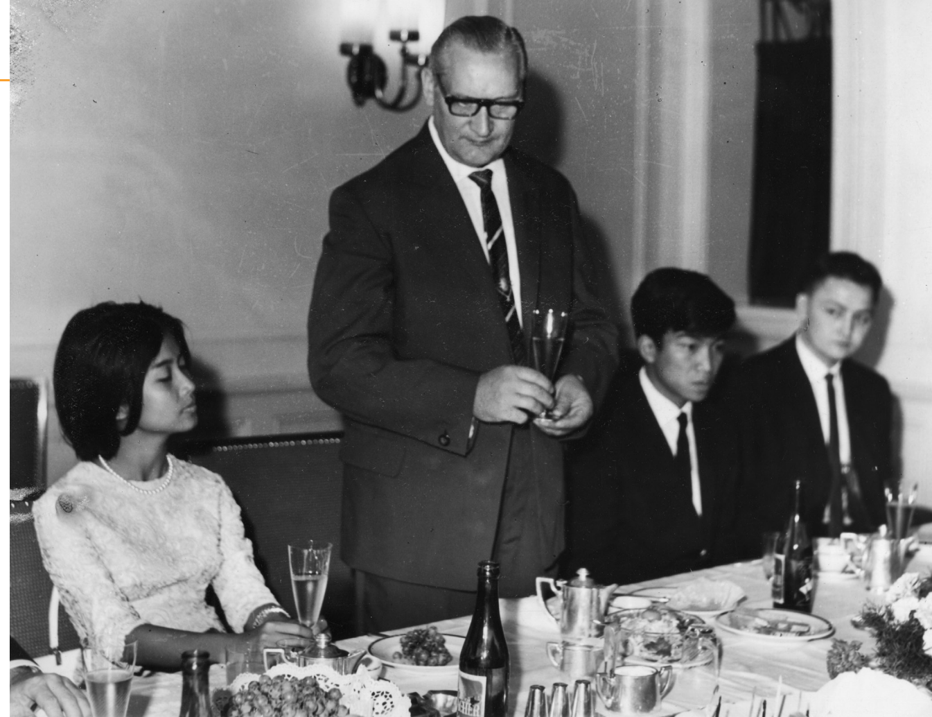
Cambodian Princess Norodom Buppha Devi during a state visit in East Germany.

of countries in the region to increase their influence and to pressure the governments of these anti-imperialistic nation states towards a pro-Western orientation. 5 During the Berlin Crisis (1958-61), which led to the permanent division of Germany into two states, Cambodia's government recognized both German states. Thereafter, the FRG and GDR intensified their political competition for diplomatic supremacy in Cambodia.