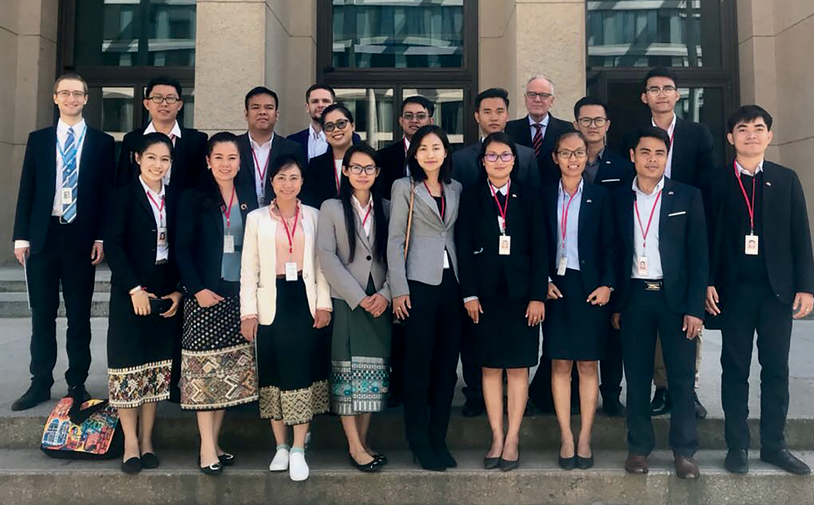
Young diplomats from Cambodia and Laos during a three week training course in the Federal Republic of Germany. The invitation was extended to the young Cambodian diplomats in the framework of the 50th anniversary of diplomatic relations between the Federal Republic of Germany and the Kingdom of Cambodia.