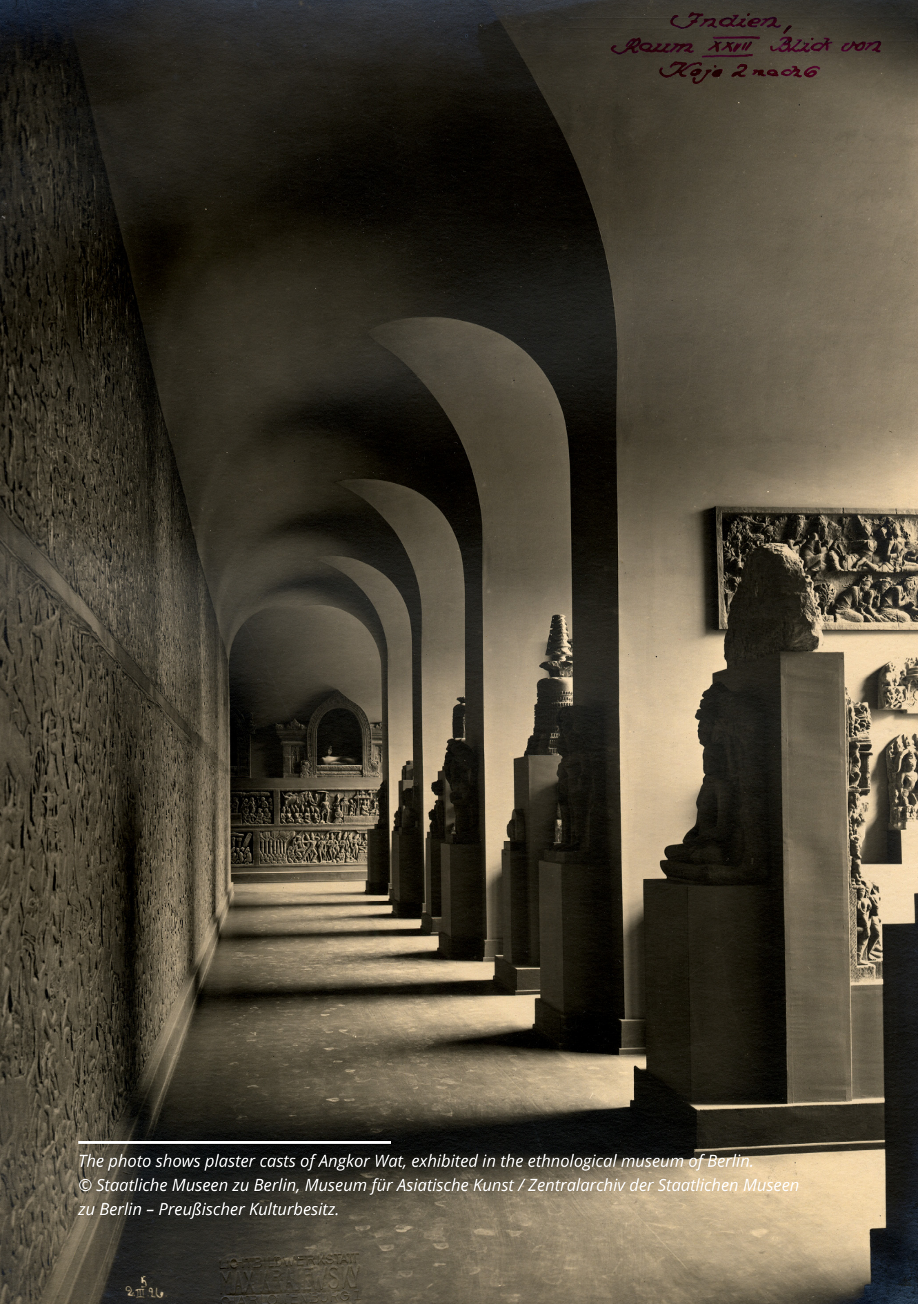
The photo shows plaster casts of Angkor Wat, exhibited in the ethnological museum of Berlin.

Indien, Raum XVII Blick vor Kolo 2 nach 6