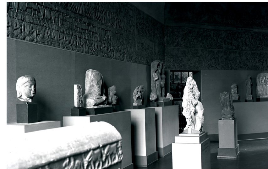
The photo shows plaster casts of Angkor Wat, exhibited in the ethnological museum of Berlin.

The history of German-Cambodian relations can be traced back to the second half of the 19 th century when the German polymath, Adolf Bastian, brought Cambodia's cultural heritage, Angkor to the attention of Imperial Germany under Kaiser Wilhelm II. Adolf Bastian visited Angkor in 1863. His book 'Reise durch Kambodja nach Cochinchina' (1864), made Cambodia more widely known in Germany. In 1873, Adolf Bastian founded the Royal Museum of Ethnology in Berlin, and as curator of the museum, organized a mission to Cambodia to produce 300 plaster casts from Angkor, including a plaster cast of a famous 200-meter-long and up to 3-meter-high bas-relief of Angkor Wat. In 1904, the plaster casts of the bas-relief were built into the wall structure of the royal museum, and along with other plaster casts of sculptures, statues and reliefs were photographed and exhibited. The German public could now gain for the first time an