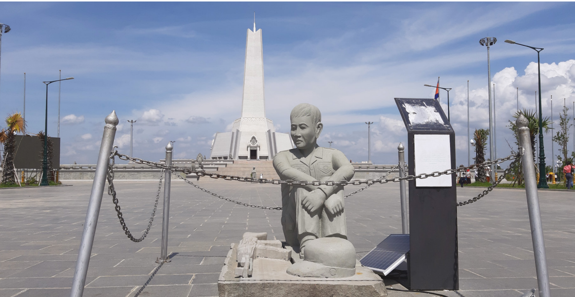
The photo shows the Win Win monument, which is a symbol of peace in Cambodia.

tunities for bilateral encounters and frank exchanges at the ASEM retreat sessions. I can say “relevancy at the high level” is there. I recalled when we were on the way back from Milan, the Prime Minister said to our delegation that “...we come all the way to Milan, we chartered a special flight to Hong Kong and then we flew on commercial flight with a big delegation and I got to deliver a speech at the plenary and the retreat for only eight minutes. But it is all at the bilateral meetings that I was able to speak frankly on many issues crucial for Cambodia, and I could say “Yes” it was well worth the trip.”