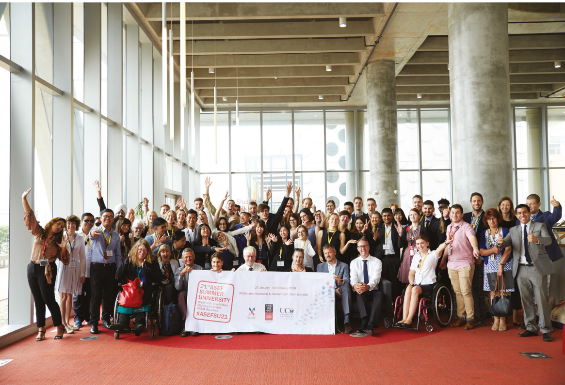
A meeting between young scholars from Europe and Asia at the 21 st ASEF Summer University in Australia.

negotiated word-for-word. Separate negotiated political declarations on specific subjects in addition to the Chair's statement, if appropriate, could be issued, thereby raising the visibility of the issue treated.