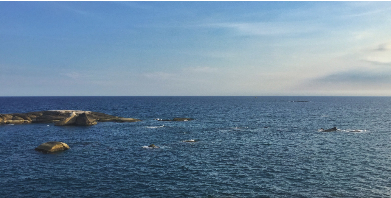
The photo displays the South China Sea, which is of tremendous strategic importance to the global trade and market. It is currently subject to maritime territory disputes between Brunei, China, Indonesia, Malaysia, the Philippines, Singapore, and Vietnam.

this diplomatic activity, it accessed to the Treaty of Amity and Cooperation (TAC) in 2012 and joined the ASEAN Regional Forum (ARF) as a member.