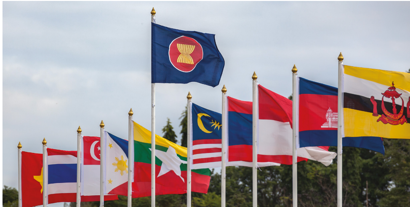
ASEAN nowadays consists of 10 countries and was created on the 08 th of August 1976. The Kingdom of Cambodia became a member of ASEAN on the 30 th of April 1999.

ASEAN has provided a reliable security shield for its member states to protect its independence and sovereignty. Mutual respect, mutual consultation, mutual understanding and mutual interest have become the norms and strengths of ASEAN in sustaining a platform or mechanism for dialogue and trust building. The success of ASEAN rests on its open, in-