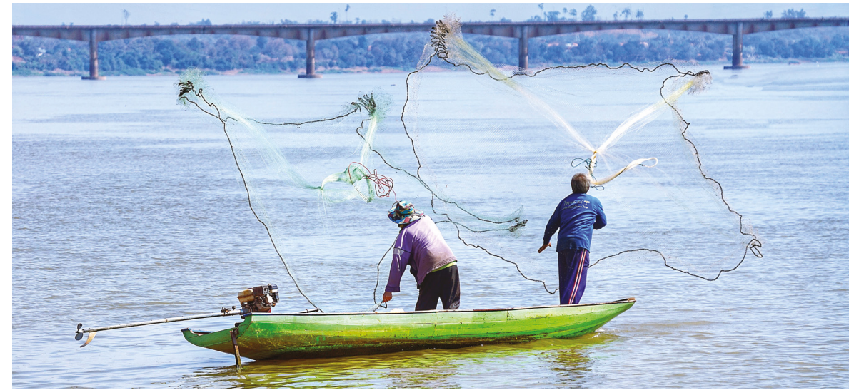
The photo shows the Mekong river that 70 million people rely on for drinking water, food, irrigation, hydropower, transportation and commerce.

during another official visit of Cambodian Prime Minister to Turkey on 20-22 October 2018, both Cambodia and Turkey signed nine agreements to further enhance bilateral cooperation in the spheres of tourism, economy, agriculture, de-mining, diplomatic institute, education, sports, water resources and investment protection. 10