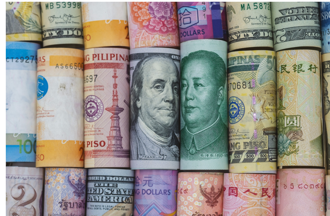
ASEM member states represent 65% of the global economy and 55% of the global trade, which means that they depend on a liberal and rules-based global world order.

The world is moving towards a historical juncture. On the one hand, with the rising status of the east and the declining of the west in the international pattern and the further development of the world multi-polarization, the global governance system and international order are changing towards a more just and rational direction. On the other hand, the world economy lacks growth momentum and the economic globalization has suffered setbacks and the