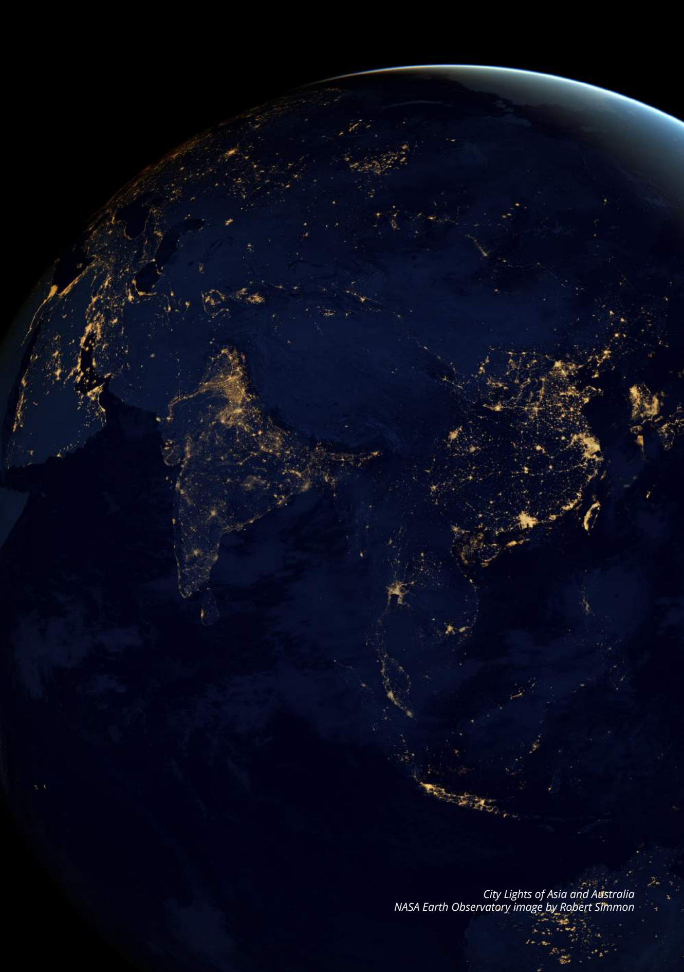
City Lights of Asia and Australia