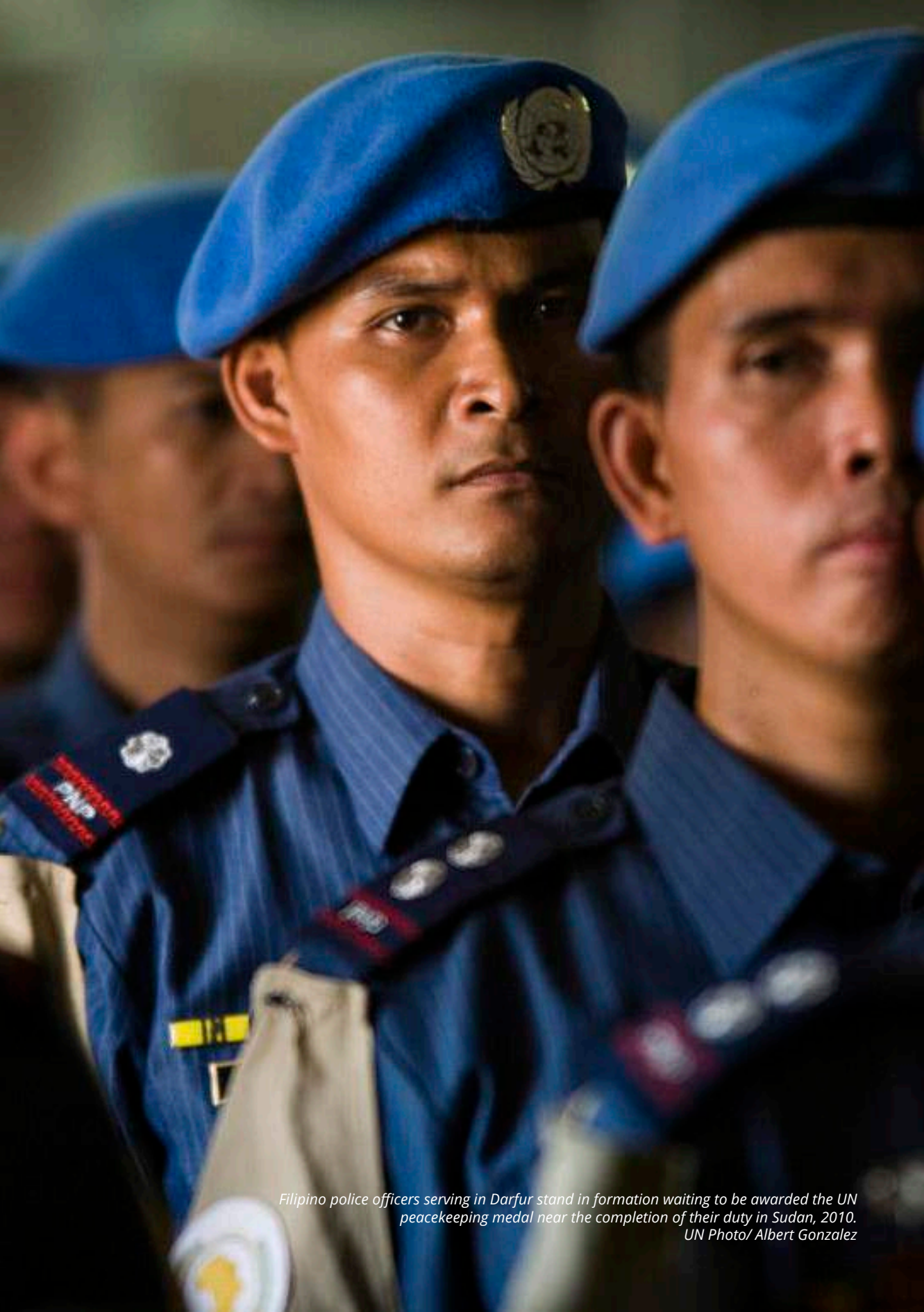
Filipino police officers serving in Darfur stand in formation waiting to be awarded the UN peacekeeping medal near the completion of their duty in Sudan, 2010.