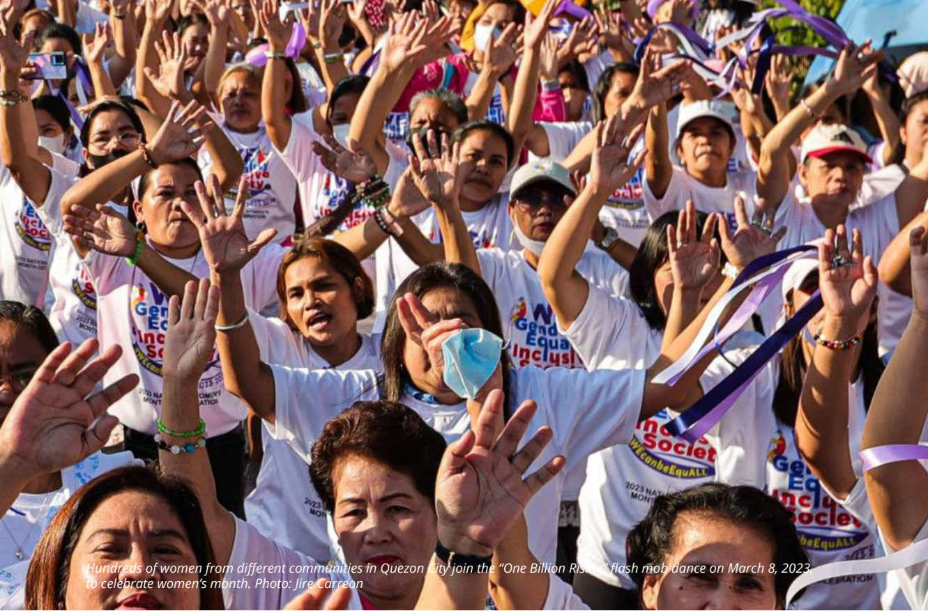
Hundreds of women from different communities in Quezon City join the “One Billion Rising” flash mob dance on March 8, 2023, to celebrate women’s month.