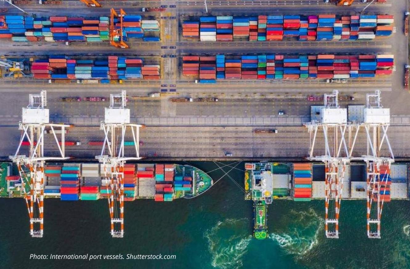
Photo: International port vessels.