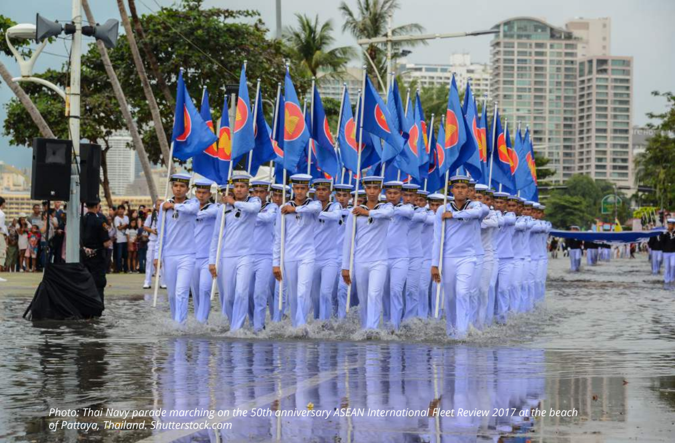
Photo: Thai Navy parade marching on the 50th anniversary ASEAN International Fleet Review 2017 at the beach of Pattaya, Thailand.