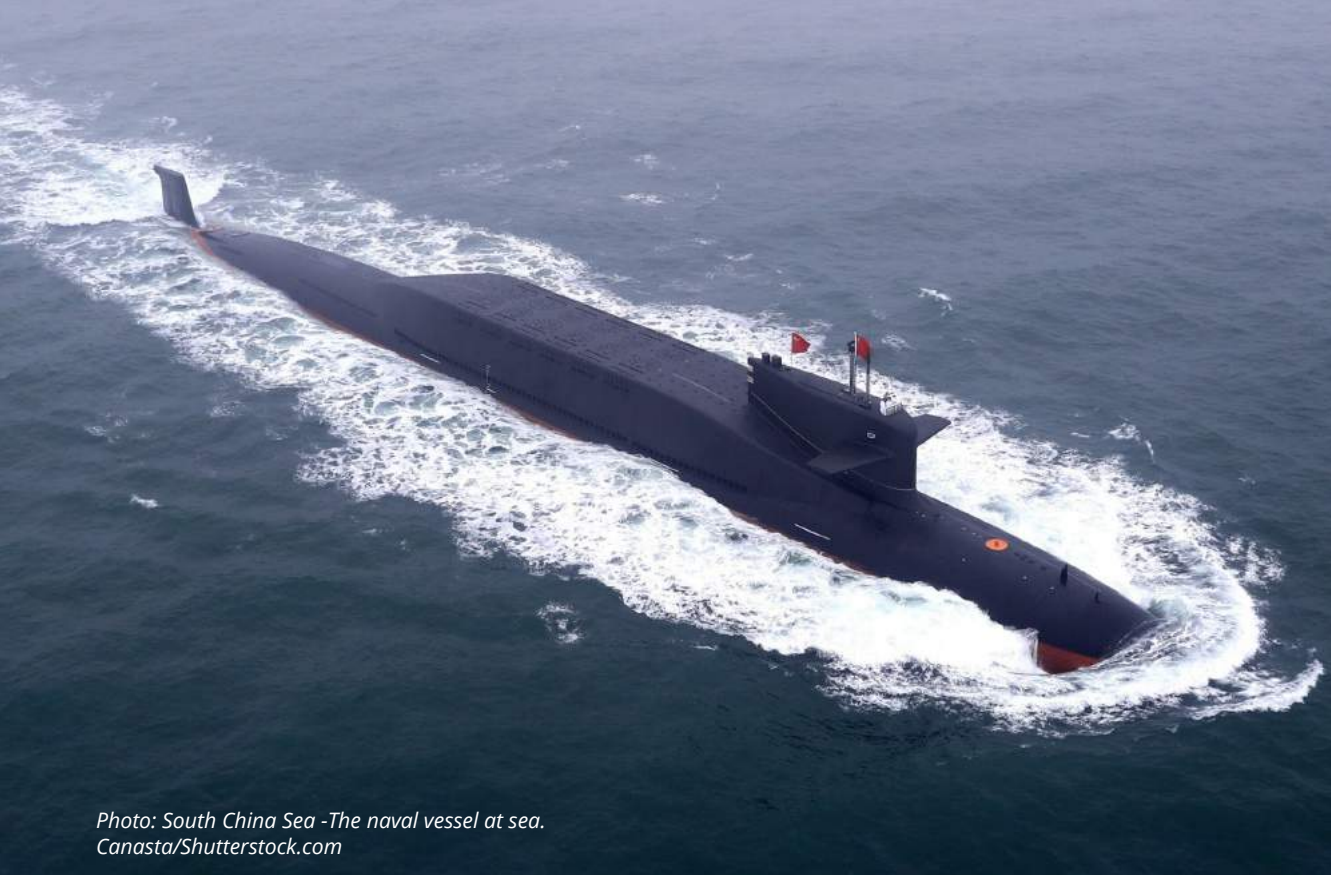
Photo: South China Sea -The naval vessel at sea.