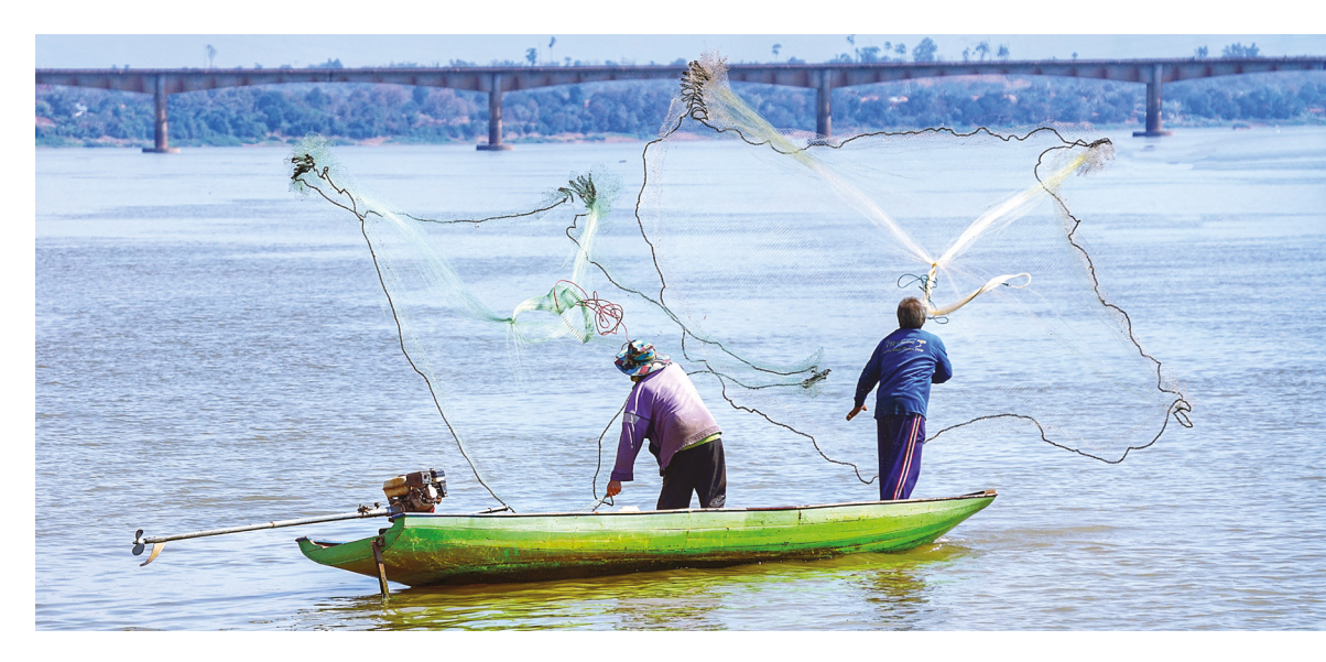
The photo shows the Mekong river that 70 million people rely on for drinking water, food, irrigation, hydropower, transportation and commerce.

For example, during an official visit by Cambodian Prime Minister to India on 25-27 January 2018, Cambodia was able to sign four official documents with her Indian counterpart, covering the aspects of human trafficking prevention, reciprocal legal assistance, culture program and provision of Indian concession loan for the water resource development project in Cambodia. Similarly,