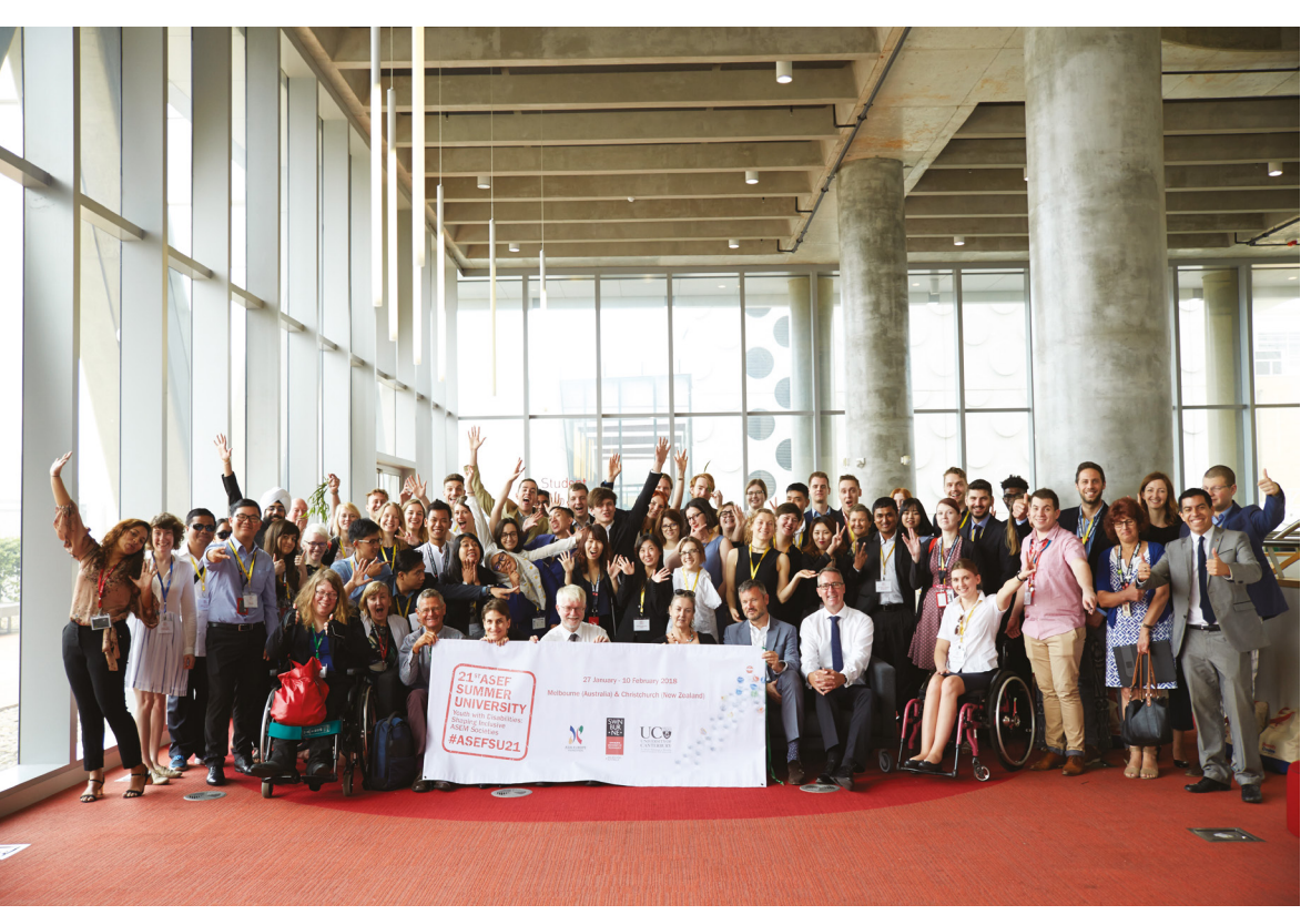
A meeting between young scholars from Europe and Asia at the 21<sup>st</sup> ASEF Summer University in Australia.

negotiated word-for-word. Separate negotiated political declarations on specific subjects in addition to the Chair's statement, if appropriate, could be issued, thereby raising the visibility of the issue treated.