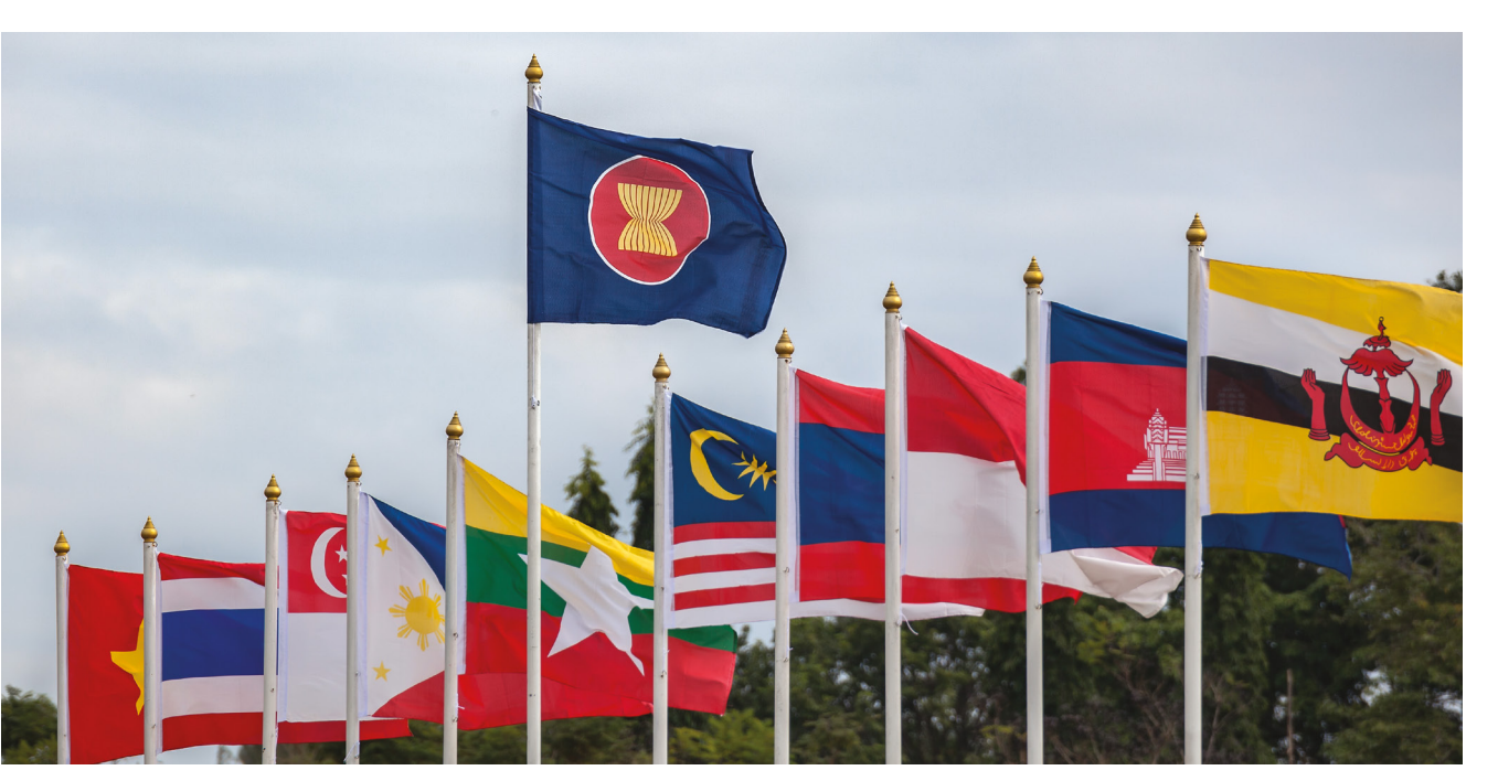
ASEAN nowadays consists of 10 countries and was created on the 08<sup>th</sup> of August 1976. The Kingdom of Cambodia became a member of ASEAN on the 30<sup>th</sup> of April 1999.

ASEAN has provided a reliable security shield for its member states to protect its independence and sovereignty. Mutual respect, mutual consultation, mutual understanding and mutual interest have become the norms and strengths of ASEAN in sustaining a platform or mechanism for dialogue and trust building. The success of ASEAN rests on its open, in-