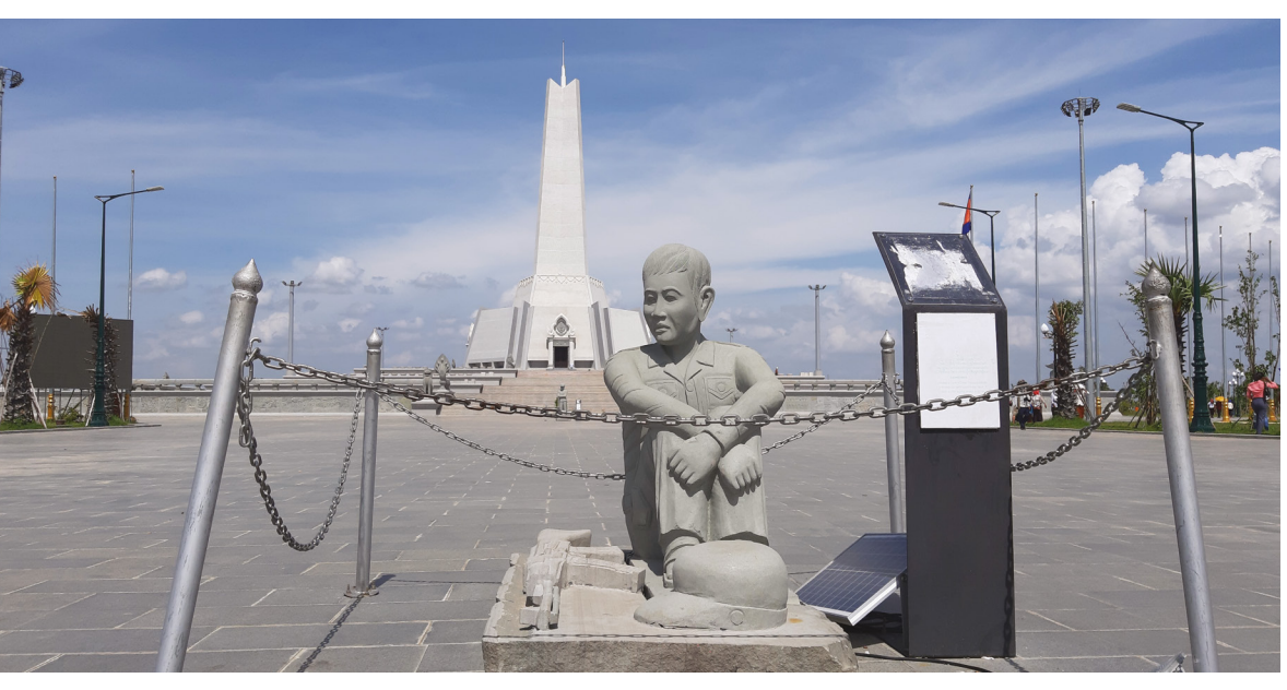
The photo shows the Win Win monument, which is a symbol of peace in Cambodia.

tunities for bilateral encounters and frank exchanges at the ASEM retreat sessions. I can say "relevancy at the high level" is there. I recalled when we were on the way back from Milan, the Prime Minister said to our delegation that "...we come all the way to Milan, we chartered a special flight to Hong Kong and then we flew on commercial flight with a big delegation and I got to deliver a speech at the plenary and the retreat for only eight minutes. But it is all at the bilateral meetings that I was able to speak frankly on many issues crucial for Cambodia, and I could say "Yes" it was well worth the trip."