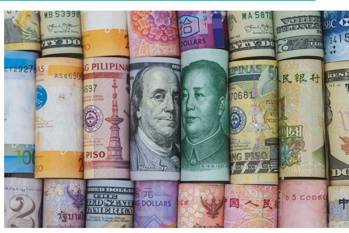
ASEM member states represent 65% of the global economy and 55% of the global trade, which means that they depend on a liberal and rules-based global world order.

The world is moving towards a historical juncture. On the one hand, with the rising status of the east and the declining of the west in the international pattern and the further development of the world multi-polarization, the global governance system and international order are changing towards a more just and rational direction. On the other hand, the world economy lacks growth momentum and the economic globalization has suffered setbacks and the