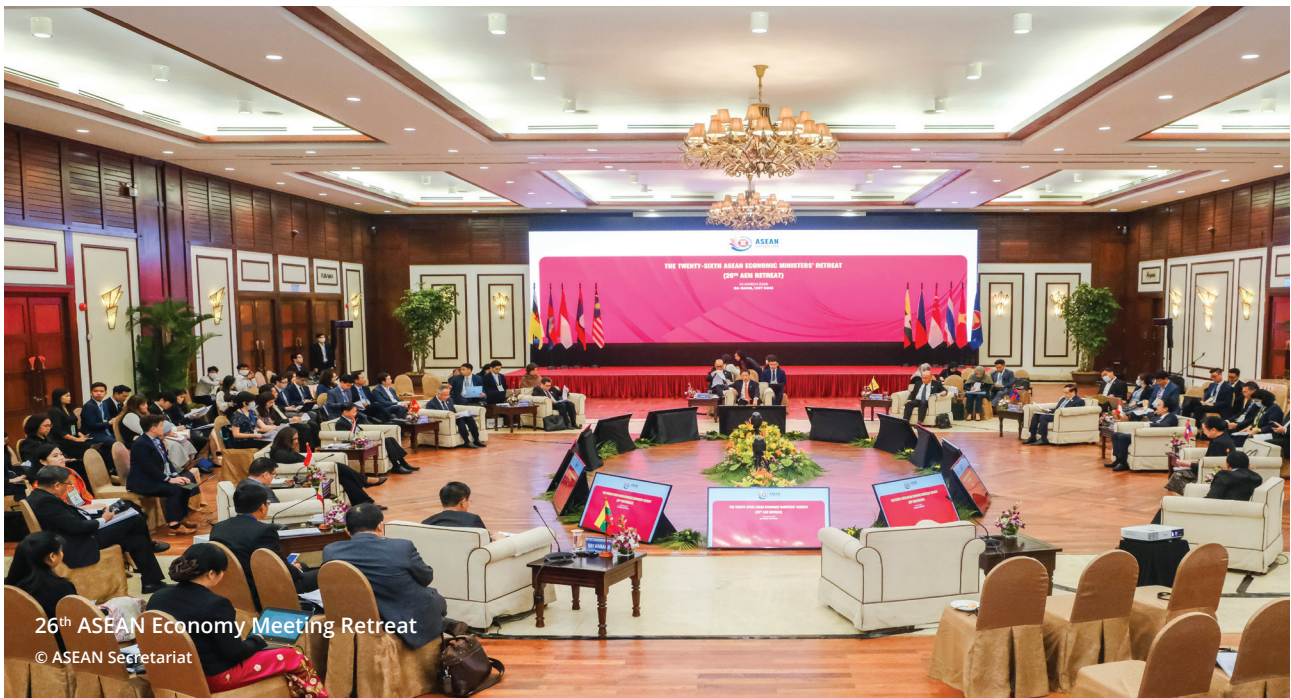
26 th ASEAN Economy Meeting Retreat