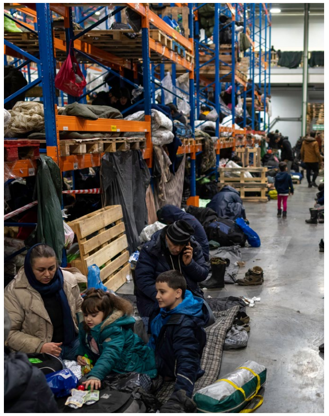
Migrants seeking shelter in a logistic center in Belarus close to the Polish border in November 2021

Many describe this sense of humiliation and connect it to their desire to leave the region. "Every time when I was arrested, I was humiliated because the dignity of individuals in this country [referring to KRI] is not protected. When I am humiliated and kicked in a country, I seriously do not see that country as the homeland of mine. I will leave every piece of it and will move to a place where my dignity is protected," said a young lawyer and civil society activist from the city of Sulaymaniyah, who was detained several times in the past. Evidently, the KDP-PUK-led system has not lived up to its promises.