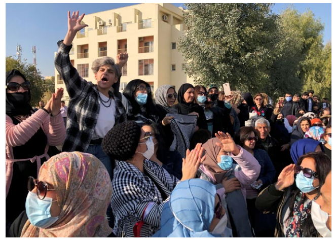
Kurdish demonstrators gather during a protest over unpaid salaries of the public servants by the Iraqi Kurdish regional government in Sulaimaniyah in December 2020