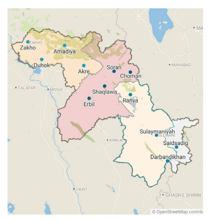
Map: Mera Jasm Bakr • created with Datawrapper

The map below demonstrates the areas across the region where the focus group discussions were conducted for this research.