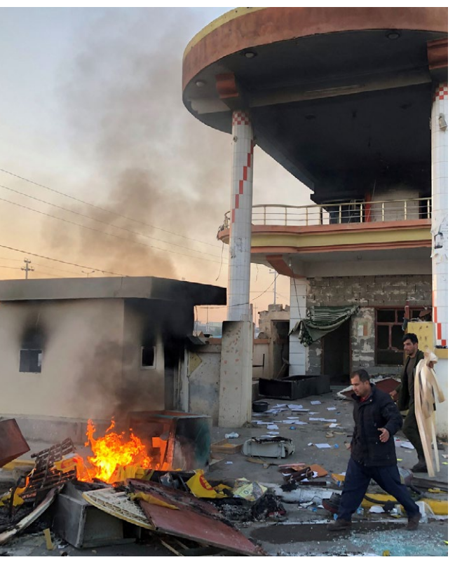
Men are seen outside the headquarters of the Kurdistan Democratic Party (PDK) after it was burnt during anti-government protests on the outskirt of Sulaimaniyah in December 2020

These three persons, who desired to emigrate, represent a variety of social classes in the KRI, ranging from working class to lower and upper middle classes as well as different educational backgrounds. The first one, who had received a sum of money to fund his journey from his father, did not finish his studies and is jumping from one unstable job to another, with his current occupation as a truck driver, receiving a monthly payment of nearly above $200. The second one graduated from a public school, but, similar to a vast majority of youth, failed to find a job in his field of study and took a job at a café with a monthly payment of $450. He utilized his years long savings to fund the journey. The third one finished school from one of the top well-known private universities across the country, with a stable job offering a monthly income over $2000, which proportionally a tiny elite in the private sector make, but still emigrated.