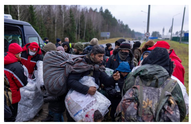
Migrants in Grodno Belarus close to the Polish border in November 202

currency of patronage). 15 However, these enterprises do not create sufficient employment opportunities, let alone absorb the youth. As a result, the majority of youth who expected to join the labor force after earning a university degree were left unemployed and without a safety net. Moreover, they received no credible assurances from the government that elder family members would receive salaries and entitlements