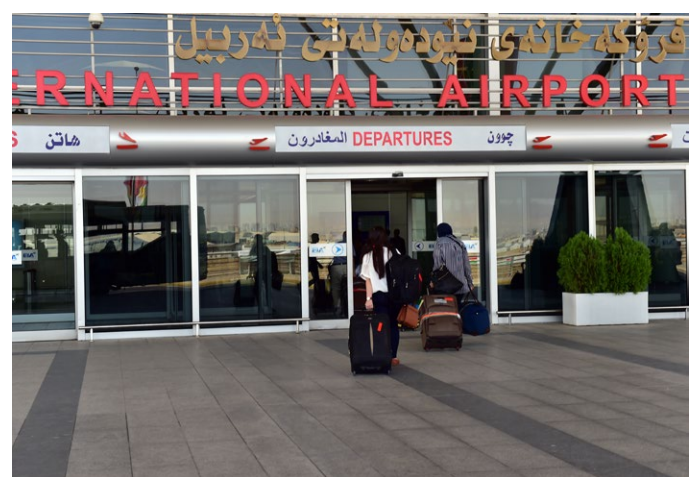
People departing from Erbil International Airport

Participants of this research connected the desire for migration to the current socioeconomic inequalities in Kurdistan. The Kurdish struggle for national liberation throughout the 20th century exposed the entire nation to oppression and violence from the successive Iraqi regimes. However, Kurds as an ethnic group are no longer perceived as facing the same destiny. Those who rule the KRI enjoy economic and political power. As former leaders of the armed struggle against the Baath regime, they believe they are entitled to rule, forgetting about the role of ordinary Kurds in successive collective struggles for self-rule and recognition. The latter now believe that "they are deprived of their homeland."