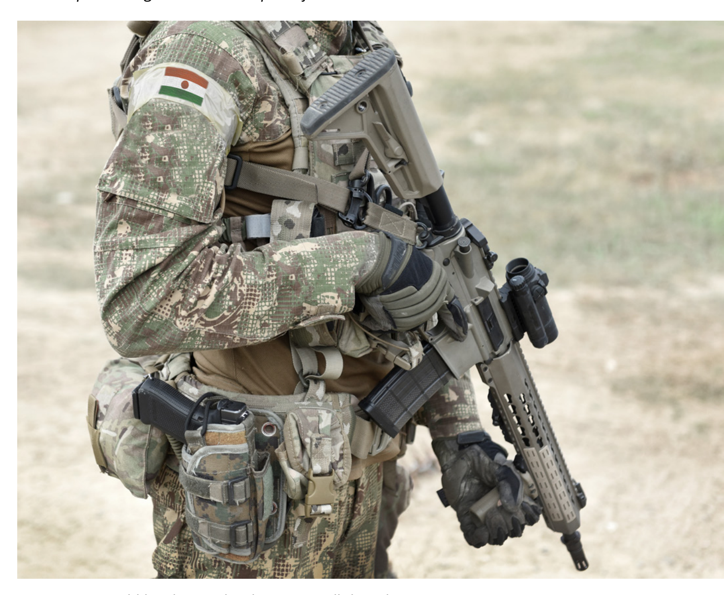
case of COIN, the strengthening of government and a political agreement on the part of stabilisation".<sup>64</sup>

However, it would be short-sighted to ignore all the other aspects being pursued under the SSR agenda (such as training police forces and border guards and enhancing the rule of law) and only focus on the narrow military capacity building aspect.<sup>65</sup> The issue with the COIN via proxy dynamic, however, is inevitably linked to the possible negative side effects that can occur after training local armed forces. In other words, what guarantees the improvement of the security situation through such an endeavour? By way of example, the ambivalence of the EU and its member states with regard to stabilisation in the Sahel can be exemplified in the work of