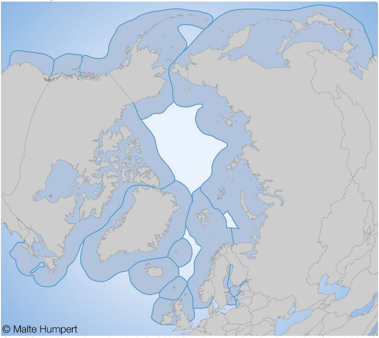
Caption: The Arctic coastal states have basically divided the region among them, based on the law of the sea. There is little to argue about when it comes to resources and boundaries, although limited disputes exist, such as that over tiny, uninhabited Hans Island/Ø and that over the maritime boundary in the Beaufort Sea between Canada and the U.S. Map: Malte Humpert, The Arctic Institute.