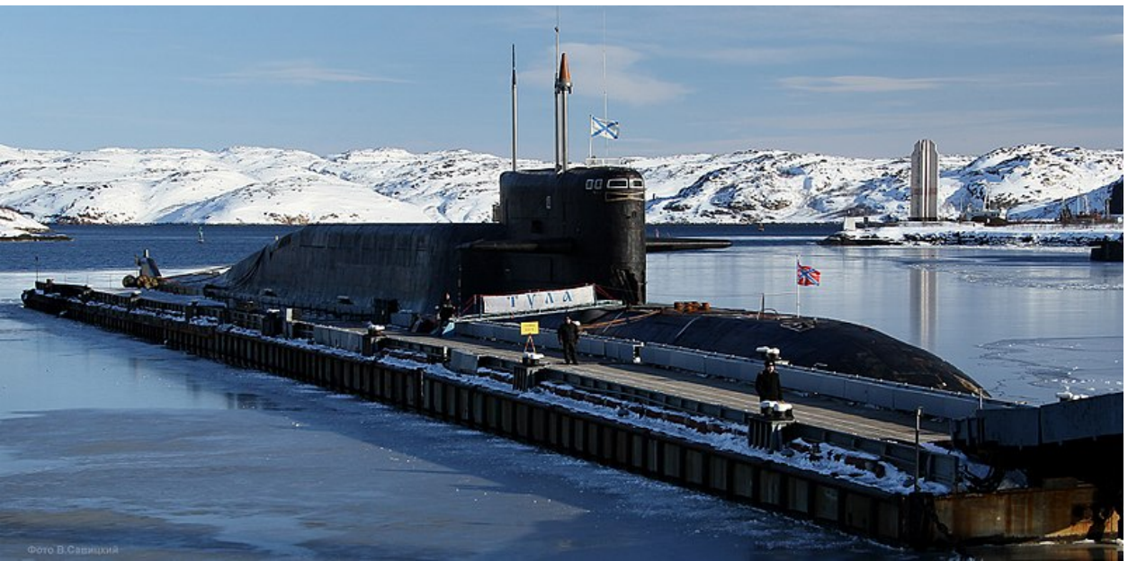
Caption: Russia's nuclear submarines based near Murmansk make the Arctic strategically important for Russia. This also defines the bilateral relationship with Norway, its nearest neighbor. These submarines are not, however, meant for the Arctic but for Russia's nuclear deterrence and strategic force posture.