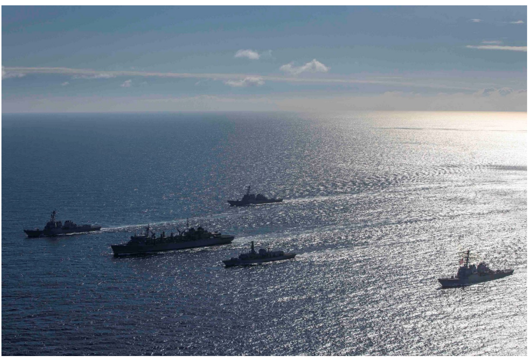
Caption: Four U.S. Navy vessels and one Royal Navy vessel sailing in the Arctic / Barents Sea in May 2020.

Why are statements by Arctic states about the region sometimes contradictory? The simple answer is that they are talking about different things taking place at the same time, in the same region. Separating between two "levels" of inter-state relations — global power politics and regional (Arctic) associations — explains why the idea of impending conflict persists and why this does not necessarily go against the reality of regional cooperation and stability. In other words, this analysis can help explain why rivalry and collaboration do co-exist in the Arctic.