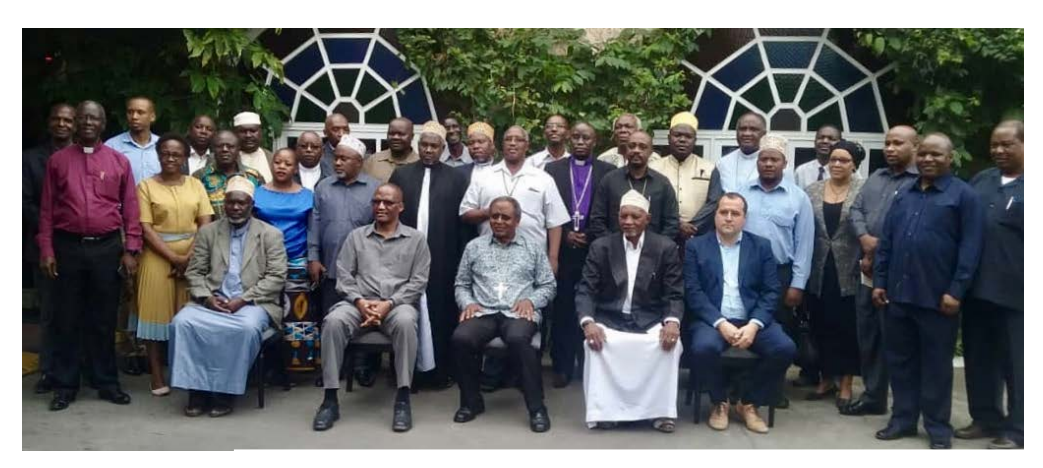
Participants of the round table discussion

ROUNDTABLE DISCUSSION AND BOOK LAUNCH DAR ES SALAAM