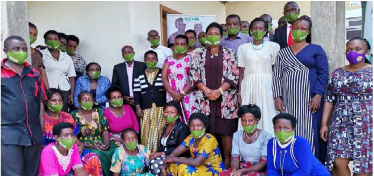
A group photo of the women leaders and their spouses in Kamwenge District

Our institutional partner ACFODE conducted a capacity enhancement training for newly elected women leaders and their spouses in Kamwenge and Kyegegwa Districts. The goal was to orient the elected councillors on their new roles and responsibilities, advocacy, lobbying, and communication skills to enable them effectively champion women's issues in local government plans and budgets.