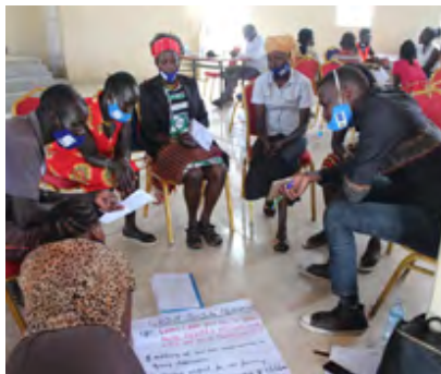
Photo: Napak District dialogue participants discussing gender responsive service delivery.

District Dialogues & Community Engagement Platforms: We facilitated dialogues with over 1300 participants from Northern Uganda. The themes of the discussions ranged from accountability over gender responsive service delivery and to public resources management. Some of the critical issues that stood out were insecurity, scarcity of water, gaps in the health sector, lack of infrastructure in schools and gender based violence.