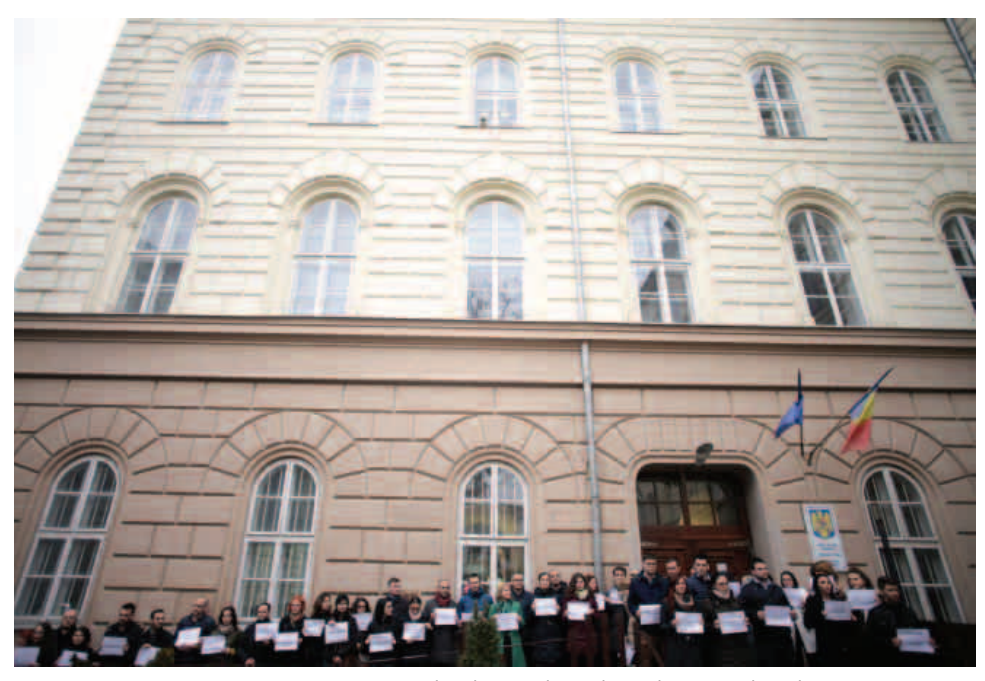
Timișoara magistrates' protest against the changes brought to the justice laws by GEO no. 7, in front of Timișoara Dicasterial Palace, Friday, February 22, 2019.