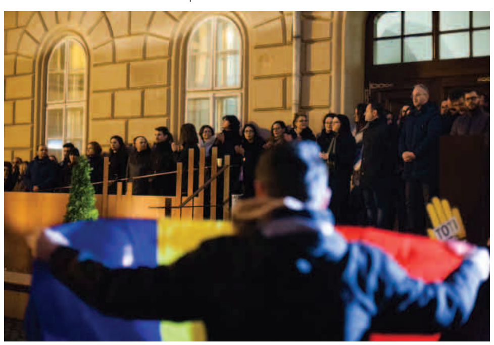
Approximately 50 magistrates protesting at the main entrance of Timişoara Local Court and the Prosecutor's Office attached to Timişoara Local Court, against the changes parliamentarians wanted to bring to the justice laws, Timişoara, Timiş, Monday, December 18, 2017.