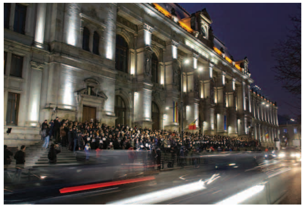
Bucharest Court of Appeal's magistrates protesting against the changes brought to the justice laws and the Penal Code, Monday, December 18, 2017.