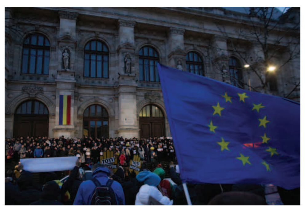
Bucharest magistrates' protest against the changes brought to the justice laws by GEO no. 7, on the steps of Bucharest Court of Appeal, Friday, February 22, 2019.