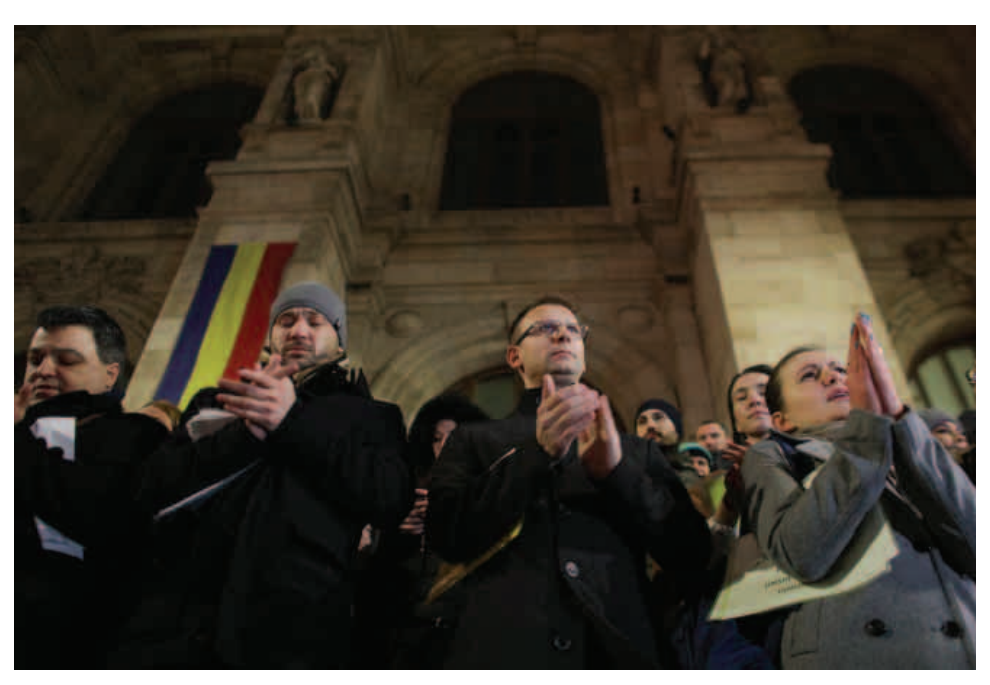
Bucharest magistrates' protest against the changes brought to the justice laws by GEO no. 7, on the steps of Bucharest Court of Appeal, Friday, February 22, 2019.