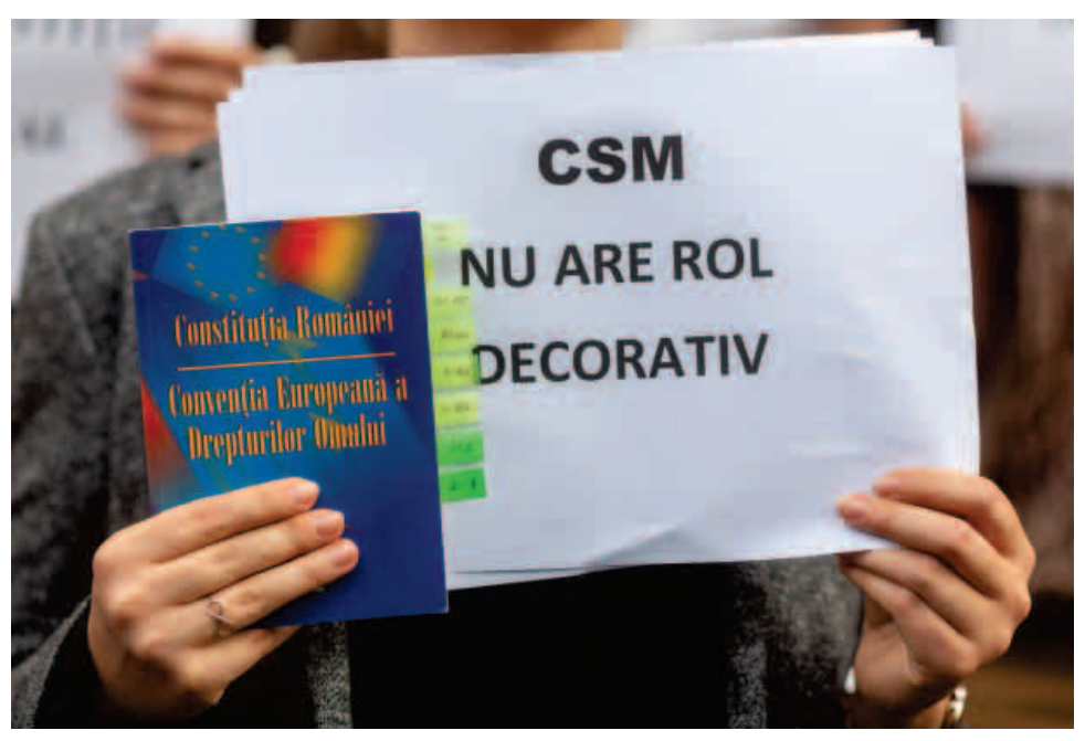
Magistrates' representatives from all over the country protesting in front of the Court of Appeal, against the way Justice is managed, Bucharest, Sunday, September 16, 2018.