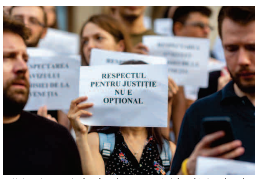
Magistrates' representatives from all over the country protesting in front of the Court of Appeal, against the way Justice is managed, Bucharest, Sunday, September 16, 2018.