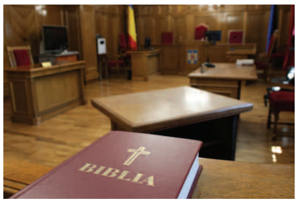
Courtroom inside the High Court of Cassation and Justice in Bucharest.