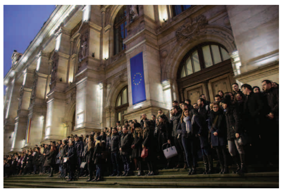
Bucharest Court of Appeal's magistrates protesting against the changes brought to the justice laws and the Penal Code, Monday, December 18, 2017.