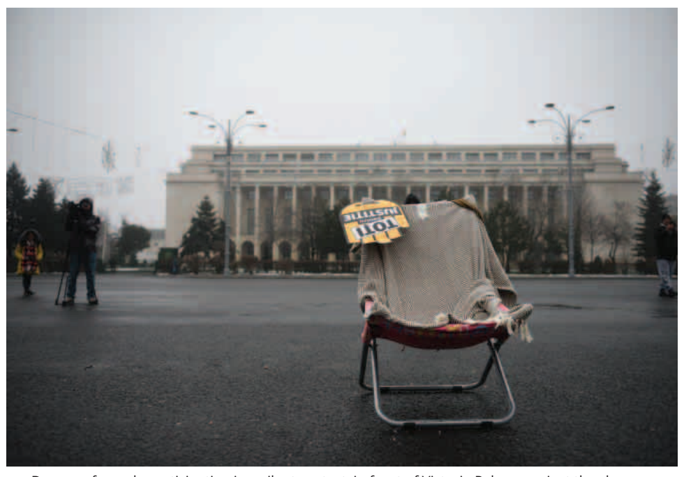
Dozens of people participating in a silent protest, in front of Victoria Palace, against the changes brought to the justice laws, the Penal Code and the Criminal Procedure Code, Sunday, January 21, 2018. The protest is part of a wide international movement known as "Stolen Justice".