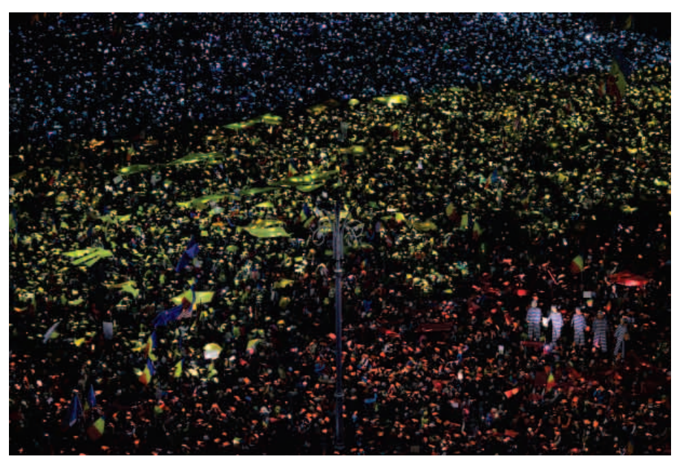
People protesting, for the 13<sup>th</sup> consecutive day, against Grindeanu's Cabinet and PSD leadership, forming an immense version of the Romanian flag in Victoria Square, February 12, 2017.