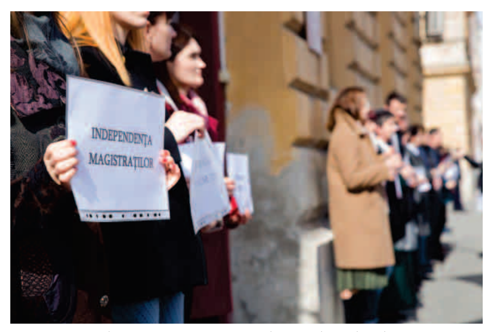
Sibiu magistrates protesting against the recent changes brought to the justice laws, Friday, March 8, 2019.