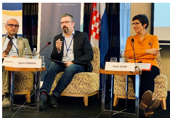
Panellists discuss multimedia as a rescue package for traditional media