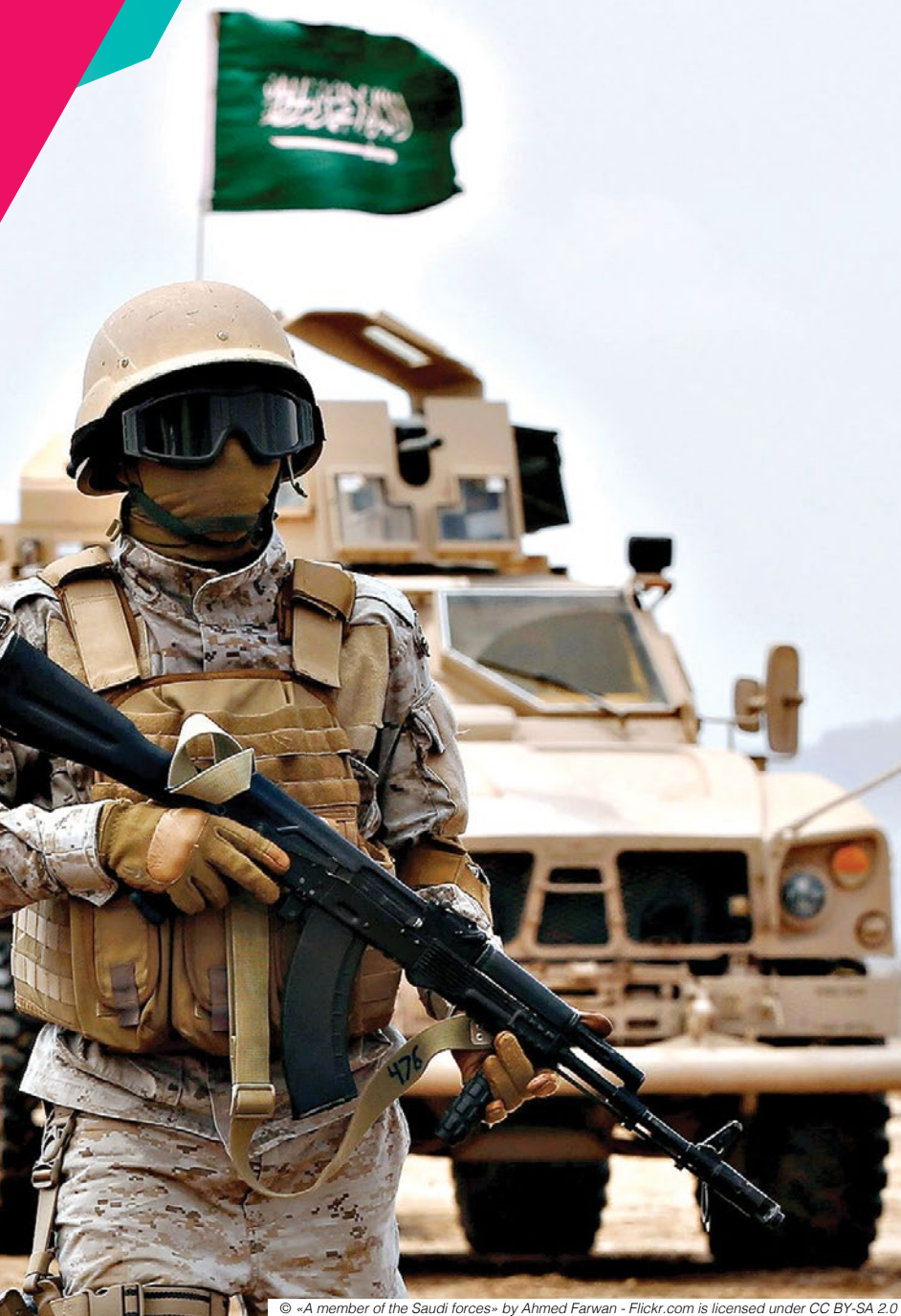
© «A member of the Saudi forces» by Ahmed Farwan - Flickr.com is licensed under CC BY-SA 2.0

A member of the Saudi forces stands to attention during a visit by Yemeni Prime Minister Khaled Bahah at the Saudi-led coalition military base in Yemen's southern embattled city of Aden.