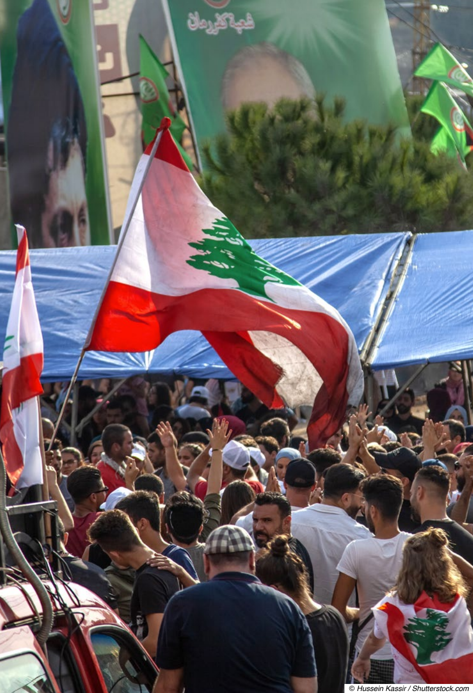
Protesters raise the Lebanese flag to the sky in revolution against government. This picture was taken in southern Lebanon's Nabatieh on October 10, 2019.