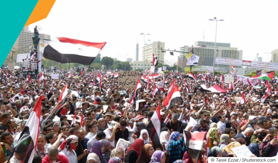
Crowds with Egyptian flags in Tahrir Square on February 4, 2011, during the Egyptian revolution that led to the resignation of President Mubarak a few days later.

Unlike the elite-led liberation struggles and mass rallies at the twilight of the colonial era that built social contract narratives and legitimacy on the back of military iconography and dead nationalists, the struggles leading up to the Arab Spring birthed a pantheon of citizen martyrs focused on the loss of individual dignity following their brutal deaths: Palestine's al-Durah (2000), Egypt's Khaled Said (2010), Tunisia's Mohamed Bouazizi (2010), and Syria's Hamza Ali al-Khateeb (2011), among many galvanizing icons then and in subsequent years. In Tunisia, the constriction and hollowing out of the public space left the "moralization of bodily behavior" as an "essential practice whereby individuals could recover some sense of dignity" (Marzouki, 2011, p. 154). When Bouazizi set his body ablaze on December 17, 2010, the messaging was clearly understood by Arab publics, that this was the absolute tragic conclusion to the long story of indignity. As Fukuyama (2012) noted in an editorial: