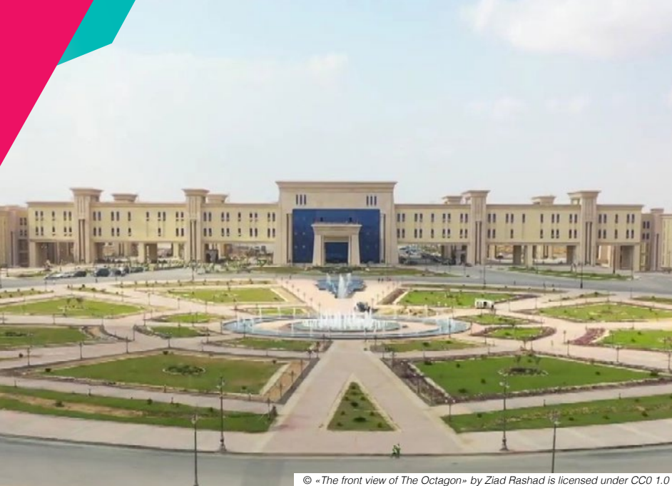
© «The front view of The Octagon» by Ziad Rashad is licensed under CC0 1.0

The Octagon is the new headquarters of the Egyptian Ministry of Defense and is set to become the largest in the Middle East. It is located in the new administrative capital in Greater Cairo.