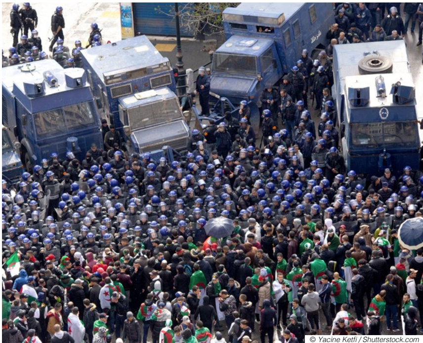
Mass protests in the so-called Hirak led to the fall of President Bouteflika. The picture was taken on March 22, 2019 in Algiers, Algeria.

This malady is widely reflected in contemporary Arab poetry, novels, art, films, theatre, and cultural productions that paint a picture of smallness in the face of shapeless crushing bureaucracies, armies, and security forces. “Every man is from dust and unto dust he shall return, except the Arab. The Arab is from the secret police, and unto the secret police he shall return” ( Tramontini & Milich, 2014–2015, p. 114), wrote Syrian poet Muhammad al-Maghut