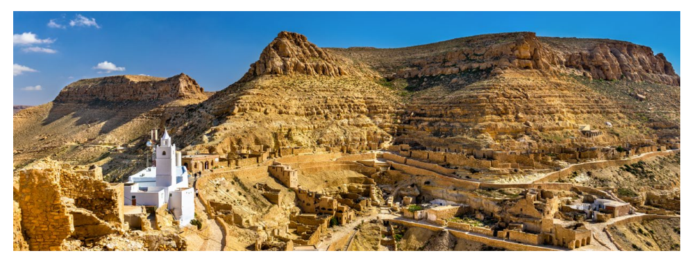
Panorama of chenini, a fortified berber village in Tataouine governorate, South Tunisia

The Governorate of Tataouine is located in the southwest of Tunisia, 500 km south of the capital. With an area of 38,889 km, it represents about a quarter of Tunisia and is home to over 151,000 residents. Eight delegations, seven municipalities, and 64 sectors make up the area. Tataouine is one of the richest provinces in Tunisia in terms of natural resources, mainly fuels, gypsum, and marble. According to official figures, its oil and gas fields represent 40% of Tunisian oil production and 20% of the country's gas production. 55