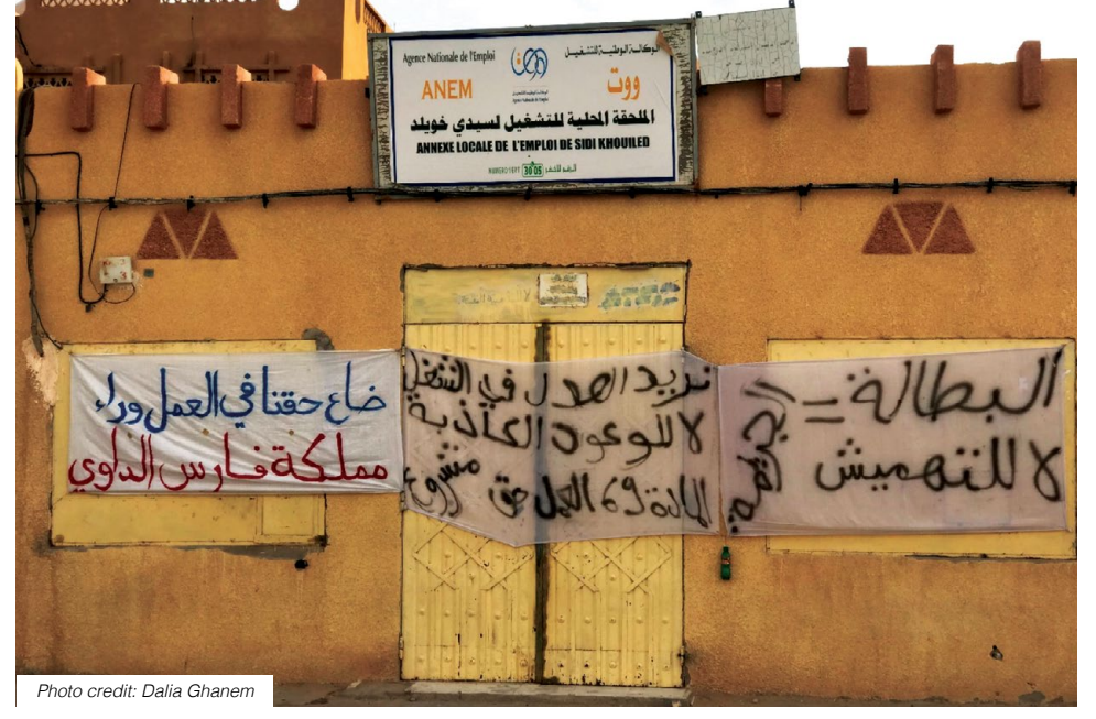
ANEM's Local branch in Sidi Khouiled. Signs put by demonstrators. Unemployment = crime. We want justice in employment, no to false promises. Employment is a guaranteed right (article 69).

Algiers began enacting reforms in reaction to the formation of the CNDDC and the demonstrations that the MSJ organized. However, while the authorities made minor changes in development models and carried out limited investments in infrastructures,