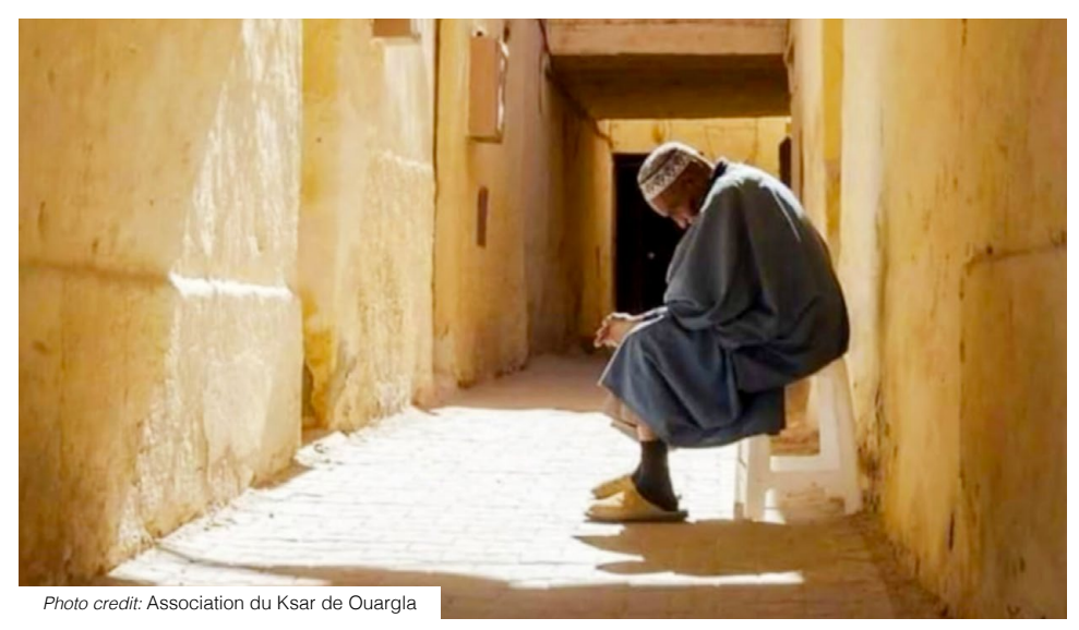
Old man sitting in the Ksour (Old city).

Ouargla is one of the largest oases of the Algerian Sahara, with an area of 163,263 km² and 400,000 inhabitants. Three districts and seven municipalities make up the wilaya (province).<sup>4</sup> Ouargla City, which lends its name to the province, is the administrative center and an asset center, an oil production wilaya (province).<sup>5</sup> Oil production from the Hassi Messaoud oil fields keeps the country's economy afloat. Hassi Messaoud produces 400,000<sup>6</sup> barrels per day and holds 71% of the country's crude oil reserves.<sup>7</sup> The province is also the fourth military region (RM IV) and home to numerous garrisons. Voices of dissent arose in this resource-rich province, with an expectation of greater future confrontation.