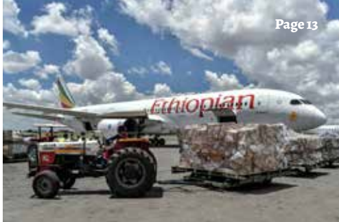
Precious cargo: an Ethiopian Airlines plane unloads medical supplies donated by Jack Ma at Nairobi's international airport.

Whether by design or not, Ma has also become a potent weapon in China's soft power arsenal. When it comes to softening China's image, and projecting a friendly face - well, they don't come much friendlier than Jack Ma. Although Ma has dabbled in charitable projects before, mostly within China, his much-publicised response to the coronavirus