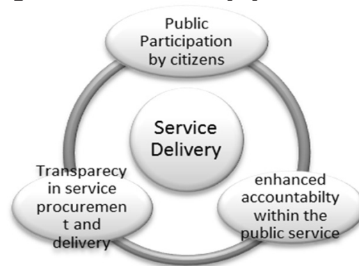
Figure 1.2 Service delivery cycle

and transparency in service delivery hence efficiency. The principle of transparency on the other hand mandates the government and public officers to conduct public affairs in an open manner. Citizens should be able to get timely access all information regarding the service delivery processes and outcomes. These processes often manifest in a given budget cycle. Citizens are then able to interrogate the amount of funds available in a given cycle, the prioritized projects and how the projects have been implemented. The relationship between the three principles in promoting efficient and effective service delivery is illustrated below.