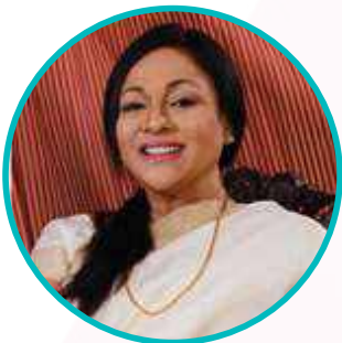
HON. GEETHA SAMANMALE KUMARASINGHE, STATE MINISTER OF WOMEN & CHILD AFFAIRS

Hon. (Mrs.) Pavithradevi Wanniarachchi is an Attorney-at-Law and a Member of Parliament in Sri Lanka, currently serving as the Minister of Wildlife and Forest Resources Conservation. She has an impressive record of serving in various ministerial portfolios, including Women & Child Affairs, Social Security, Health & Indigenous Medicine, Power & Energy, Technology & Research, Cultural Affairs & National Heritage, Youth Affairs, Samurdhi & Poverty Alleviation, and Plan & Implementation. She was a member of several parliamentary committees, including the Women Parliamentarians Caucus, Select Committee of Parliament to ensure gender equity and equality, Committee on Parliamentary Business, and several others. She has been a member of the Parliament for Ratnapura District since 1994 and previously served in the Sabaragamuwa Provincial Council from 1993 to 1994.