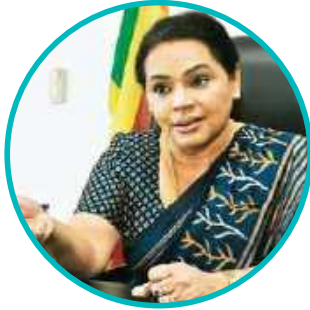
HON. DIANA GAMAGE

Hon. Gamage became a parliamentarian in 2020 through the National List of SJB. A lawyer and an actress, she has also contested in the provincial council elections and the local government elections before. She has a Masters in Business Administration and a LLB from the United Kingdom. She was seen as a controversial political figure as she switched her political affiliation to SLPP in 2021, while holding the position of Deputy Secretary of SJB.