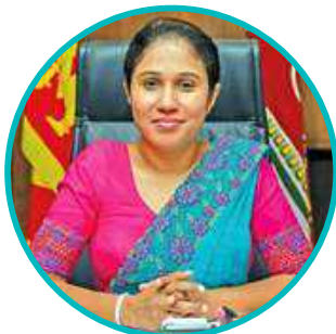
HON. (DR.) SEETHA ARAMBEPOLA, DEPUTY CO- CHAIR OF WPC AND STATE MINISTER OF SKILLS DEVELOPMENT, VOCATIONAL EDUCATION, RESEARCH AND INVENTIONS

Dr. Arambepola is one of the two Deputy Co-Chairpersons of the Women Parliamentarians Caucus in the 9th Parliament of Sri Lanka. An ENT surgeon by profession, she has served as a medical doctor both locally and internationally since 2013. Serving as the Governor of the Western Province from December 2019 to March 2020, she resigned from office to enter Parliament through the National List of SLPP. Currently she serves as the State Minister of Health. Until May 2022, she was the State Minister of Skills Development, Vocational Education, Research and Innovation. In her role as the State Minister, she has held collaborative partnerships with local and international stakeholders in order to improve the skills and education sector in the country. She is also a member of the Select Committee of Parliament to look into and report to Parliament, its recommendations to ensure gender equity and equality with special emphasis on looking into gender based discriminations and violations of women's rights in Sri Lanka (Select Committee on Women and Gender), and the House Committee. She has also served in the Ministerial Consultative Committee on Education.