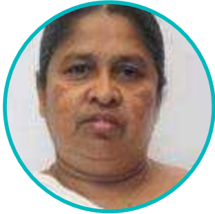
HON. MANJULA DISSANAYAKA

Hon. Manjula Dissanayake is a Member of Parliament and former teaching instructor (ISA) by profession. She has been actively involved in politics since 2009, serving as a member of the North Western Provincial Council. In 2018, she was re-elected to the council. Hon. Dissanayake has also played an important role in various committees in Parliament, including the Women Parliamentarians Caucus, the Select Committee on Gender Equity and Equality, the Sectoral Oversight Committee on Education, and the Parliamentary Caucus for Children.