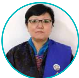
HON. TASHI CHHOZOM MEMBER OF PARLIAMENT BHUTAN

His Majesty The King granted Dhar to Supreme Court Justice Tashi Chhozom, appointing her as the Member of Parliament of the National Council of Bhutan, in accordance with Article 11.1 of the Constitution.