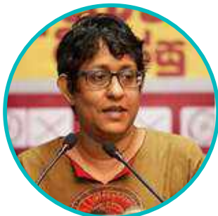
HON. (DR.) HARINI AMARASURIYA

Hon. Dr. Amarasuriya became a parliamentarian through the national list of the National People's Power (NPP) in the 9th Parliament. A senior university lecturer at the Department of Social Studies at the Open University of Sri Lanka, Hon. Amarasuriya holds a PhD in Social Anthropology from the University of Edinburgh. She is a strong feminist advocate and her research areas include gender equality, youth, education, labor & employment, and child protection. Prior to her educational career, she has served as a child protection and a psychosocial practitioner. Joining the Federation of University Teachers' Association, Dr. Harini began her activist role in 2011 as she joined the fight for improving the quality of free education. She also serves as a board member of several local NGOs working for the rights of vulnerable groups in Sri Lanka. She was the lead researcher for the National Human Development Report 2014 of Sri Lanka and also was an active member of the drafting committee for the National Youth Policy in Sri Lanka launched in 2014.