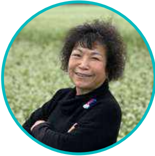
HON. DR. SANDY (YU LAN) YU MEMBER OF PARLIAMENT TAIWAN

Hon. Dr. Sandy (Yu Lan) Yu, also known as Sandy Yeh, is a legislator at large representing Kuomintang (KMT), the largest opposition party of Taiwan, the Republic of China.