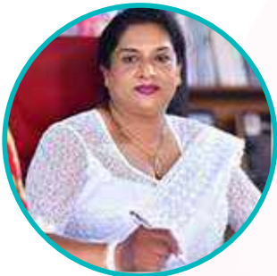
HON. MUDITHA PRASHANTHI

Hon. Manjula Dissanayake is a Member of Parliament and former teaching instructor (ISA) by profession. She has been actively involved in politics since 2009, serving as a member of the North Western Provincial Council. In 2018, she was re-elected to the council. Hon. Dissanayake has also played an important role in various committees in Parliament, including the Women Parliamentarians Caucus, the Select Committee on Gender Equity and Equality, the Sectoral Oversight Committee on Education, and the Parliamentary Caucus for Children.