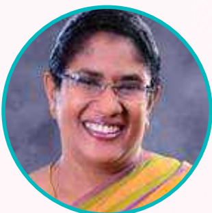
HON. THALATHA ATHUKORALA, MEMBER OF THE WPC AND CHAIRPERSON OF THE SECTORAL OVERSIGHT COMMITTEE ON GENDER AND WOMEN

A Sri Lankan film actress by profession, Hon. Kumarasinghe is the current State Minister of Women and Child Affairs. Hon. Kumarasinghe has been involved in several parliamentary caucuses, including the Women Parliamentarians Caucus in Parliament and the Parliamentary Caucus for Children. She has also served on the Select Committee of Parliament to ensure gender equity and equality and to address gender-based discrimination and violations of women's rights in Sri Lanka. Additionally, Hon. Kumarasinghe has been a member of the Sectoral Oversight Committee on Women and Gender and the Sectoral Oversight Committee on Youth, Sports, Arts, and Heritage.