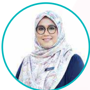
HON. YB DATUK WIRA HAJJAH MAS ERMIEYATI BINTI HAJI SAMSUDIN MEMBER OF PARLIAMENT MALAYSIA