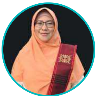
HON. LEDIA HANIFA AMALIAH MEMBER OF PARLIAMENT INDONESIA

Hon. Ledia Hanifa Amaliah is a member of the The House of Representatives of the Republic of Indonesia (DPR RI) from the Prosperous Justice Party (PKS) for the Bandung City and Cimahi City electoral districts who really cares about issues of Education, Family and People with Disabilities.