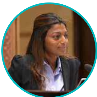
HON. EVA ABDULLA DEPUTY SPEAKER OF PARLIAMENT MALDIVES

Hon. Eva Abdulla is currently the Deputy Speaker of the People's Majlis of the Republic of Maldives and has been a representing member since the year 2009. This is her third term as a parliamentarian.