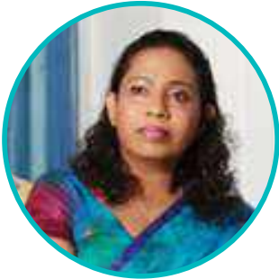
HON. PAVITHRADEVI WANNIARACHCHI, MINISTER OF WILDLIFE AND FOREST RESOURCES CONSERVATION

Hon. (Mrs.) Pavithradevi Wanniarachchi is an Attorney-at-Law and a Member of Parliament in Sri Lanka, currently serving as the Minister of Wildlife and Forest Resources Conservation. She has an impressive record of serving in various ministerial portfolios, including Women & Child Affairs, Social Security, Health & Indigenous Medicine, Power & Energy, Technology & Research, Cultural Affairs & National Heritage, Youth Affairs, Samurdhi & Poverty Alleviation, and Plan & Implementation. She was a member of several parliamentary committees, including the Women Parliamentarians Caucus, Select Committee of Parliament to ensure gender equity and equality, Committee on Parliamentary Business, and several others. She has been a member of the Parliament for Ratnapura District since 1994 and previously served in the Sabaragamuwa Provincial Council from 1993 to 1994.